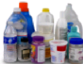
Bottles, Jars, Jugs and Tubs empty and replace cap