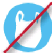
No Plastic Bags or Plastic Wrap (return to retail)