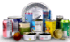
Food and Beverage Cans empty and rinse