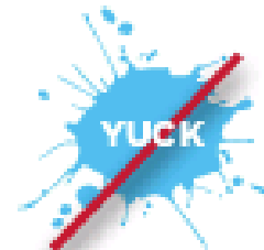
No Food or Liquid (empty all containers)