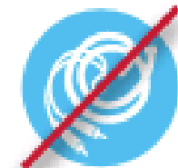
No Tanglers (no holes, wires, chains or electronics)