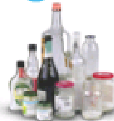
Bottles and Jars empty and rinse