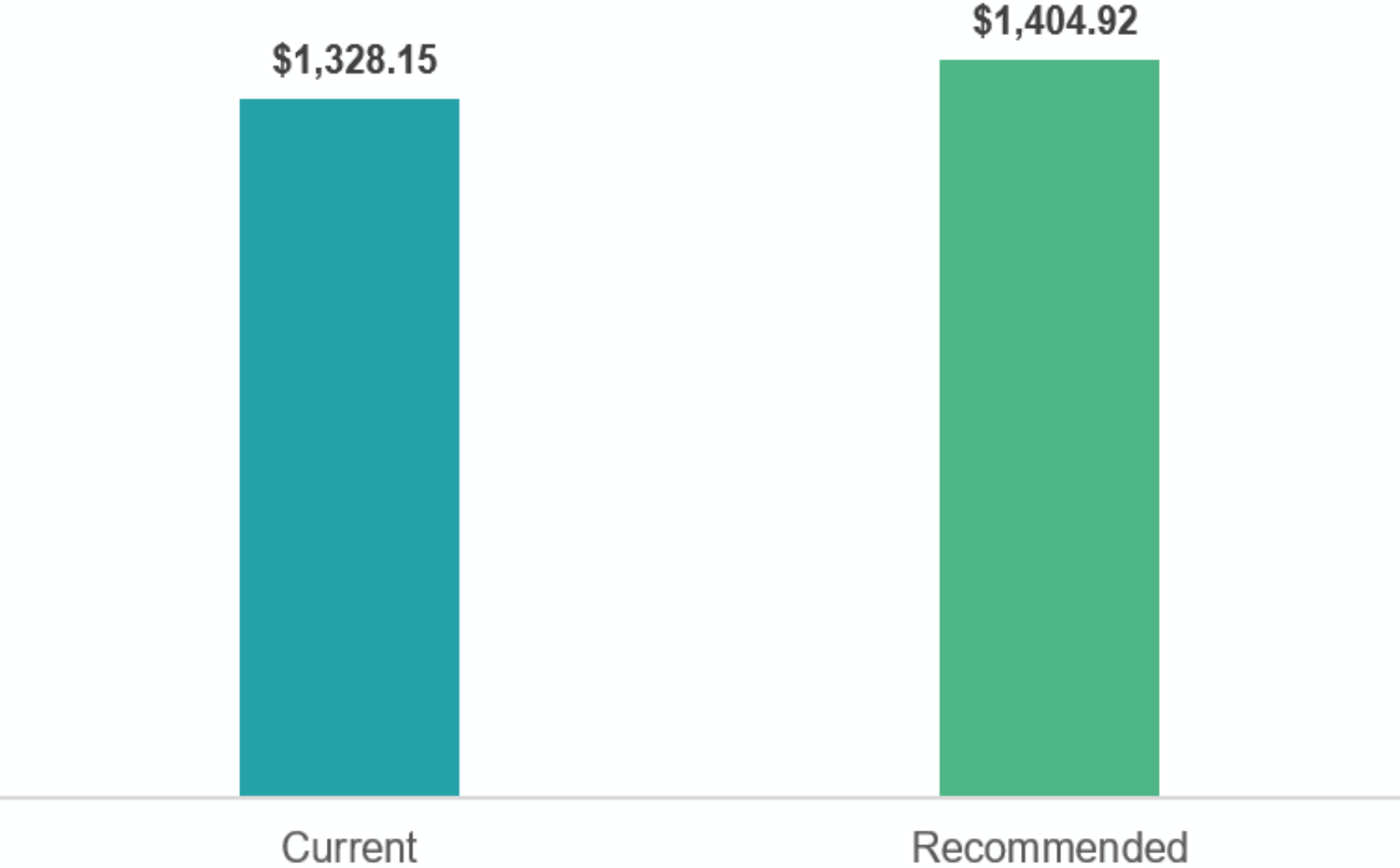
Combined Annual Water and Sewer Bill