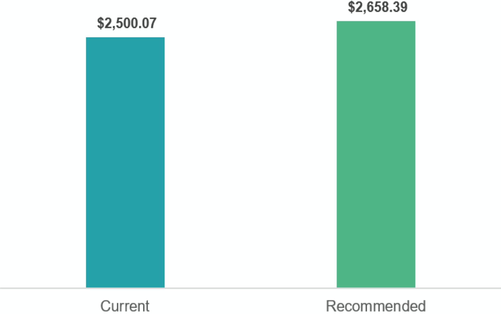
Combined Annual Water and Sewer Bill