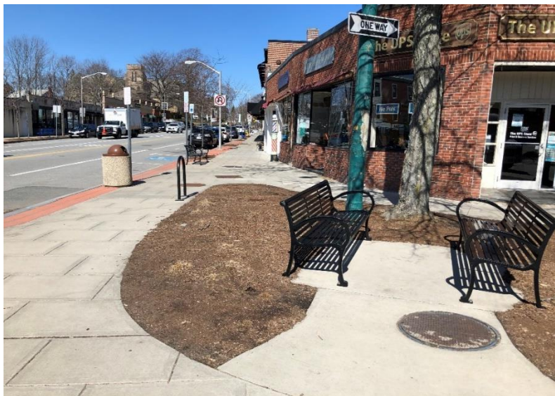
redesigned Cushing Square

transportation within Belmont, however, is quite limited, with the predominant options through the use of COA's vehicles and a recently developed volunteer driver program. Creation of cross-town options for all ages has been suggested multiple times in the past and should be reconsidered, particularly with the development of new housing in the Town. Transportation linking Belmont Center, Cushing Square and Waverley Square should be explored as a starting point. Additionally, existing options should be expanded.