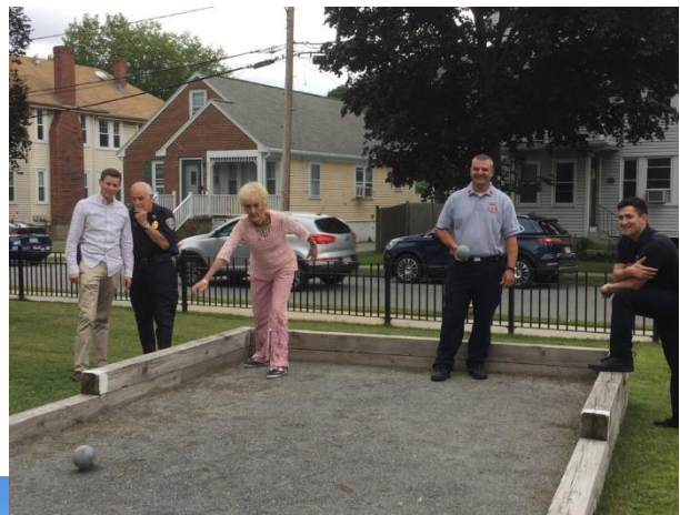
Bocce Court – Senior Center