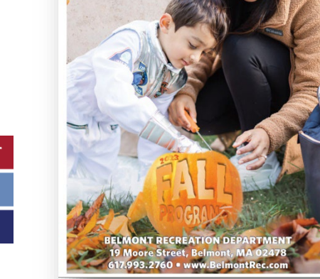
Please Click here or the image above to view the Recreation Department's Fall Programs Brochure.