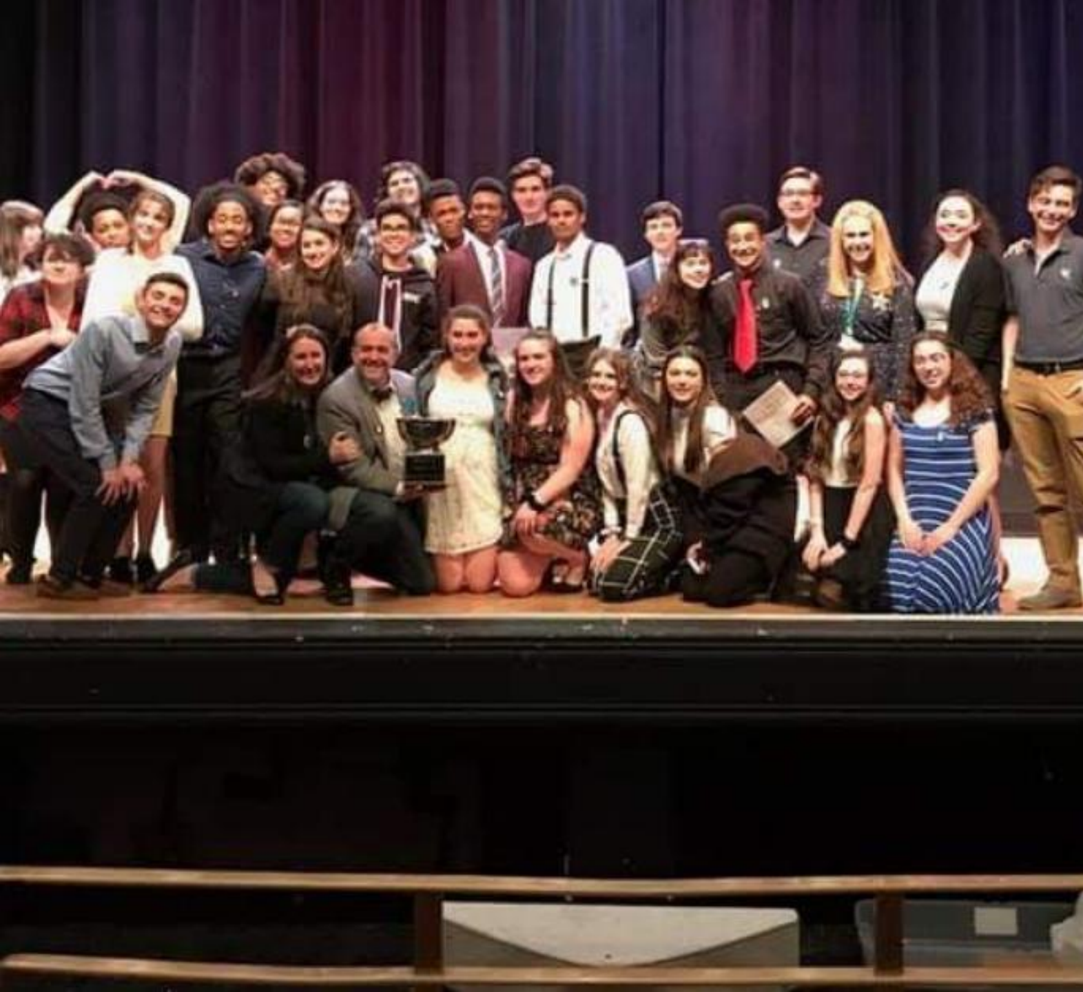
Brockton High School 4,264 students, 9-12