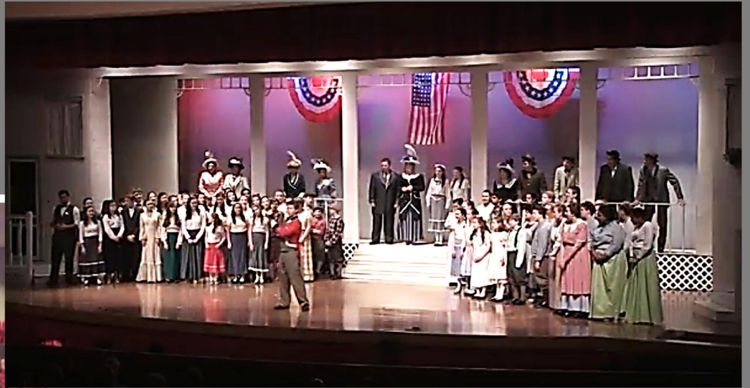
Burlington High School 1,128 students, 9-12