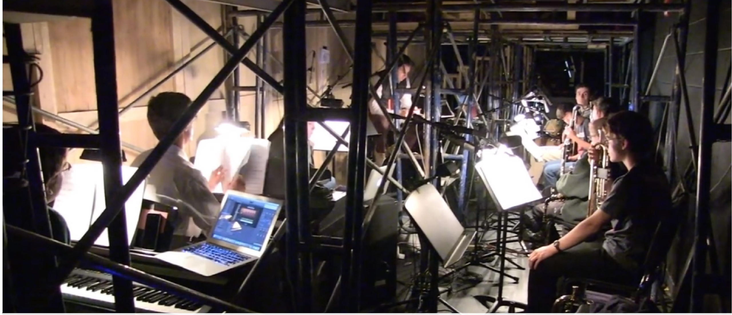
Wellesley High School 1,540 students, 9-12 * Completed in 2012