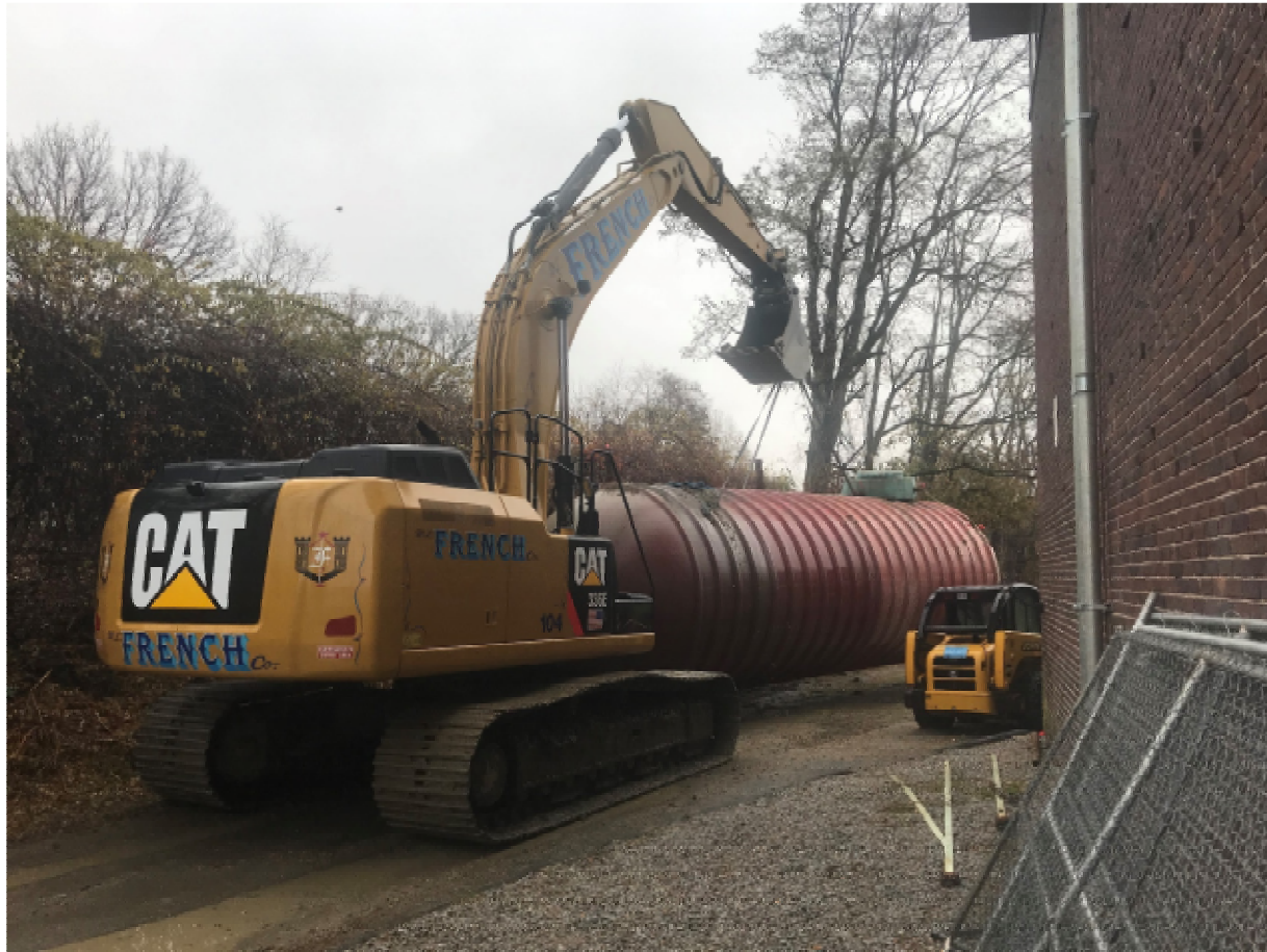
Photo 2 – Removal of Underground Fuel Storage Tank from Existing High School.