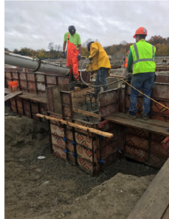
Photo 5 – Placing Concrete at Pile Cap/Grade Beam at Exterior Wall.