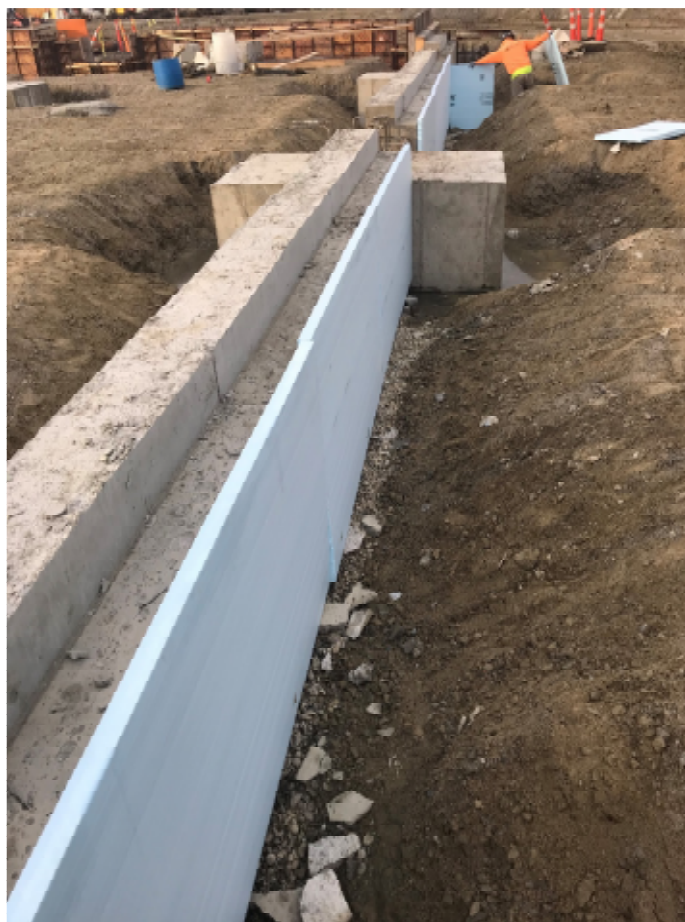
Photo 3 – Installation of Foam on Exterior Foundation Grade Beam in Preparation for Backfilling.