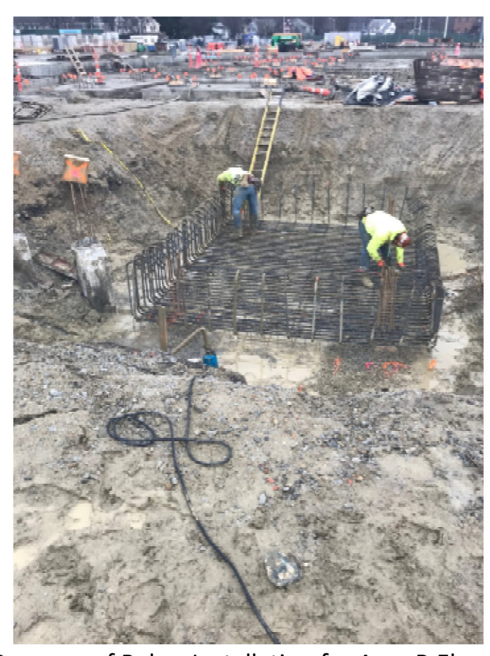
Photo 3 – Progress of Rebar Installation for Area B Elevator Pit Pile Cap.