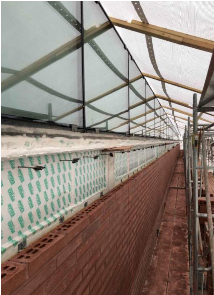
Area C, level 2 – scaffold staging for pool ceiling