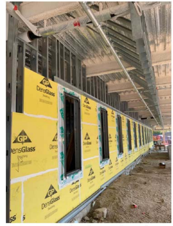
Photo 10 – Exterior Sheathing and Window Frames on Level 1 of Area A, West Elevation

Photo 9 – Installation of Bick Façade at Area A and Exterior Sheathing at Area C (Southeast Elevation)