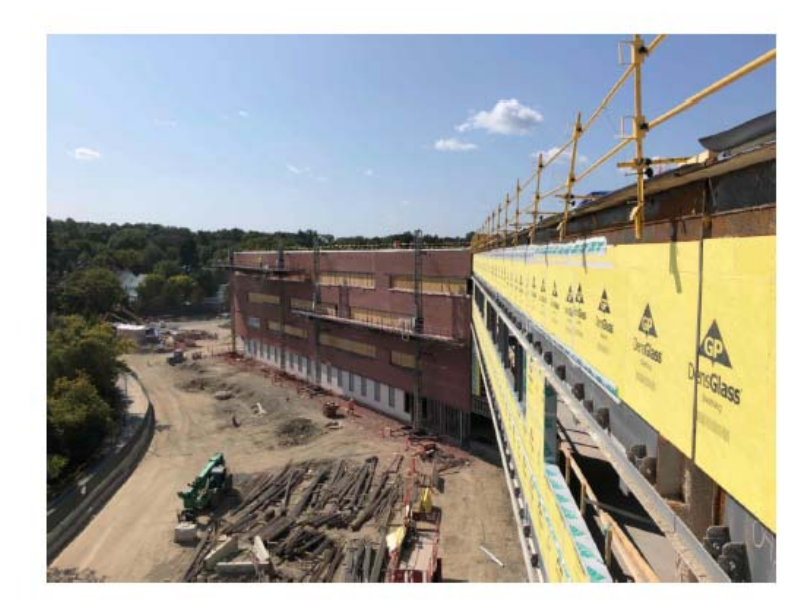
Photo 9 – Installation of Bick Façade at Area A and Exterior Sheathing at Area C (Southeast Elevation)