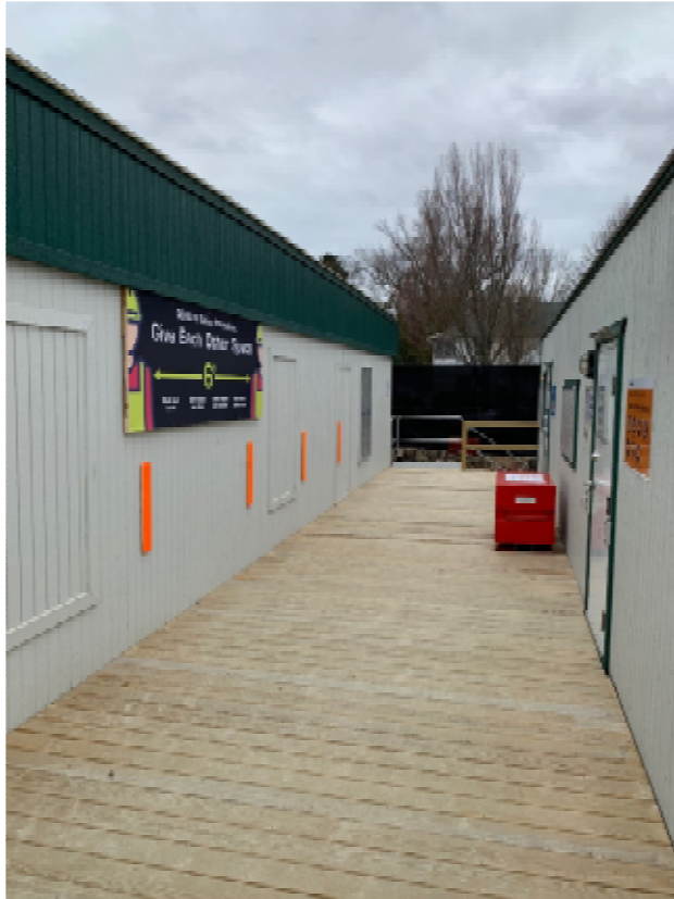
Photo 10 – Social Distancing Signage and Markers Around Trailer Complex.