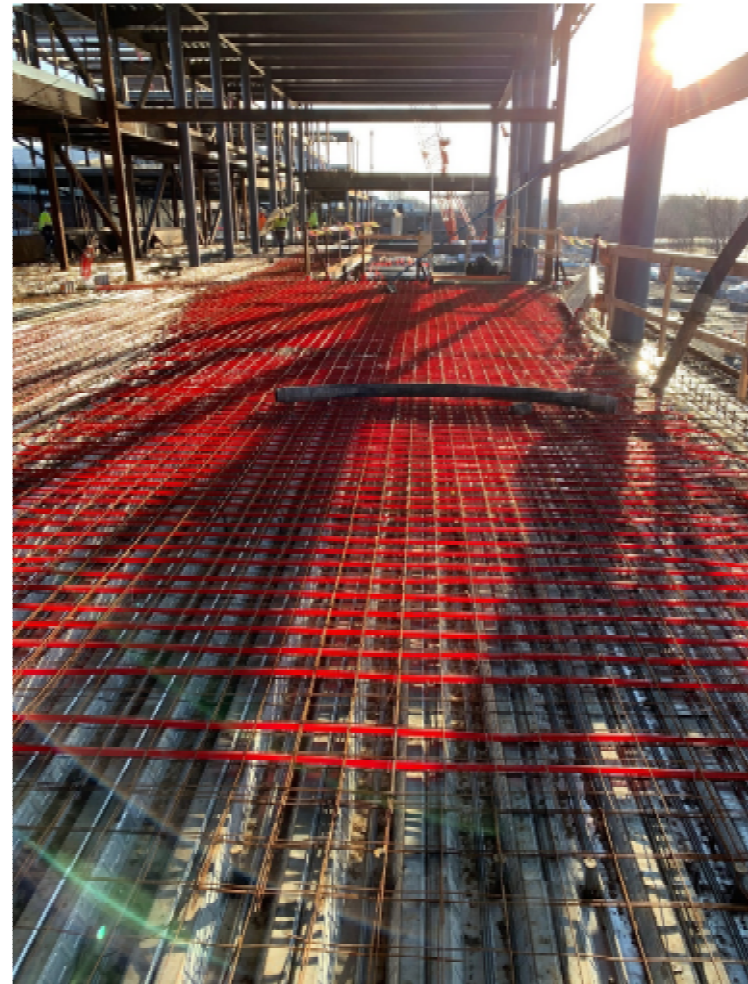
Photo 2 – Field of Radiant Flooring Completed Prior to Concrete Placement..