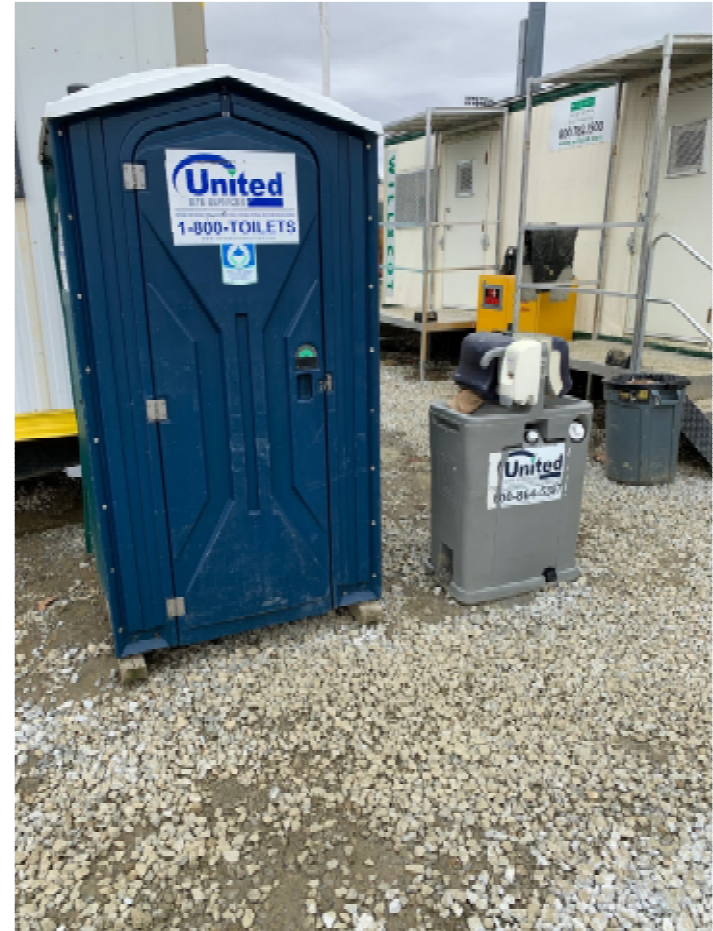
Photo 9 – Temporary Hand-Wash Stations Provided by United Site Services.