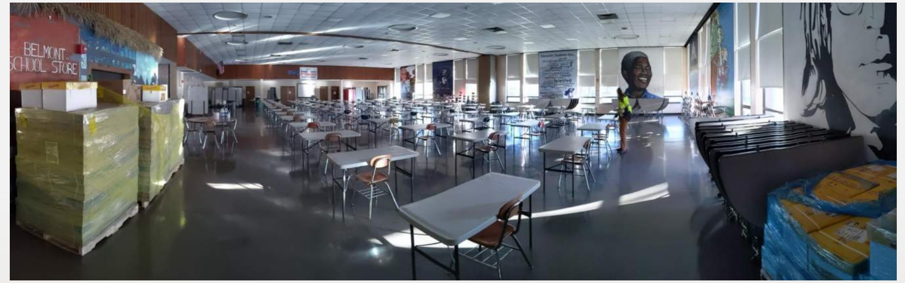
Cafeteria with Tables and Student Desks