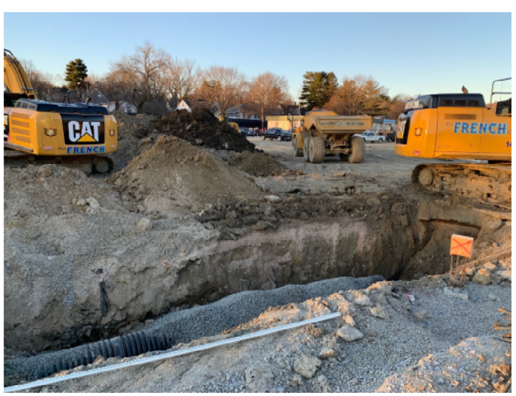
Photo 6 – Progress of Drainage Installation at South Side of A Wing.