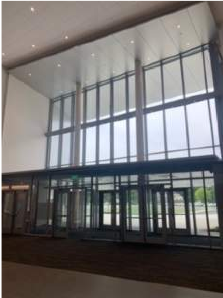
- Corridor A100A