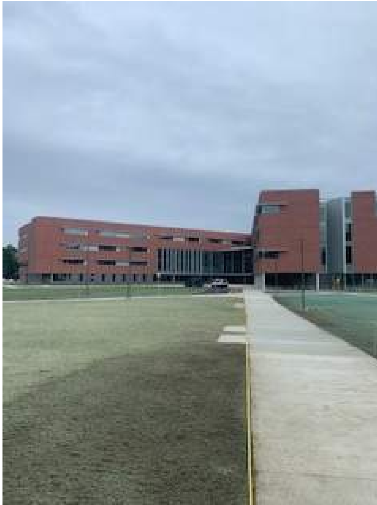
- Areas A and B