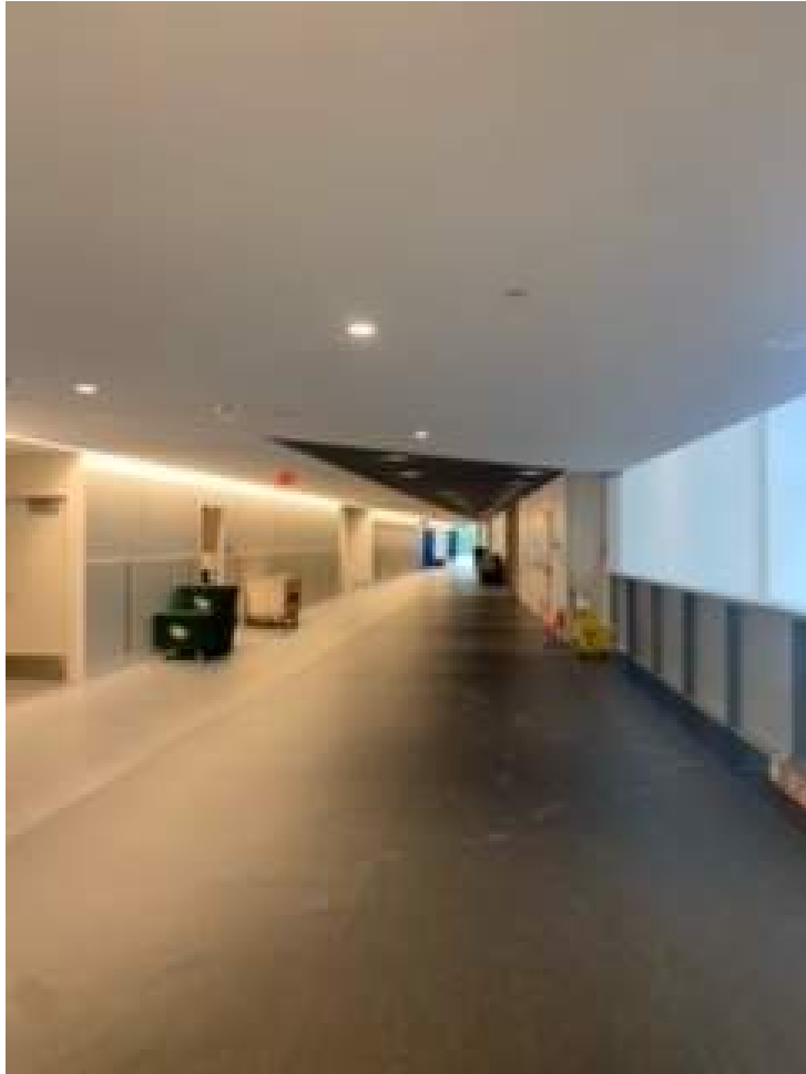
- Corridor A200