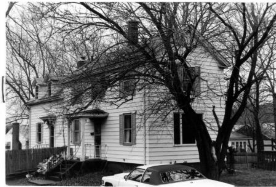
Photo of house in 1982