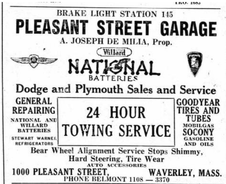
Advertisement in 1937 and 1944 Directories