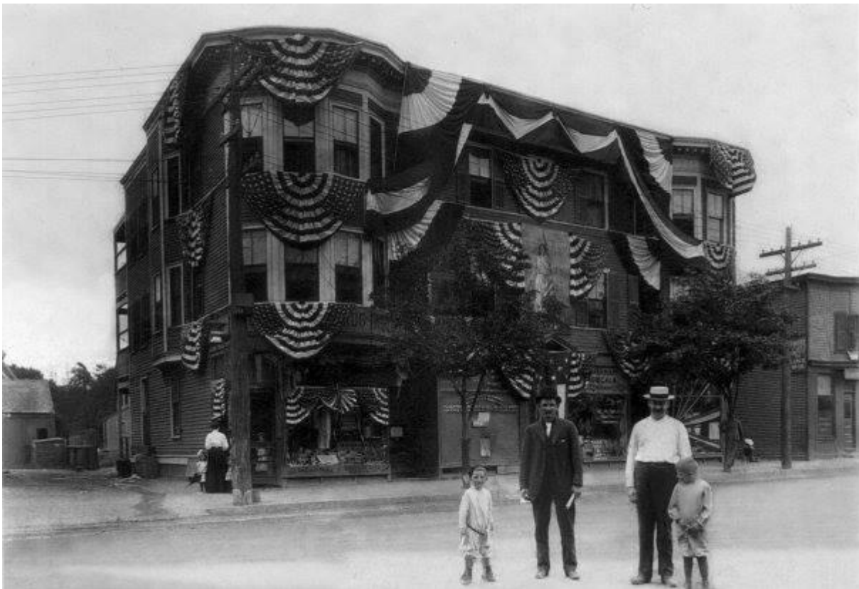
Daley Block, 1914