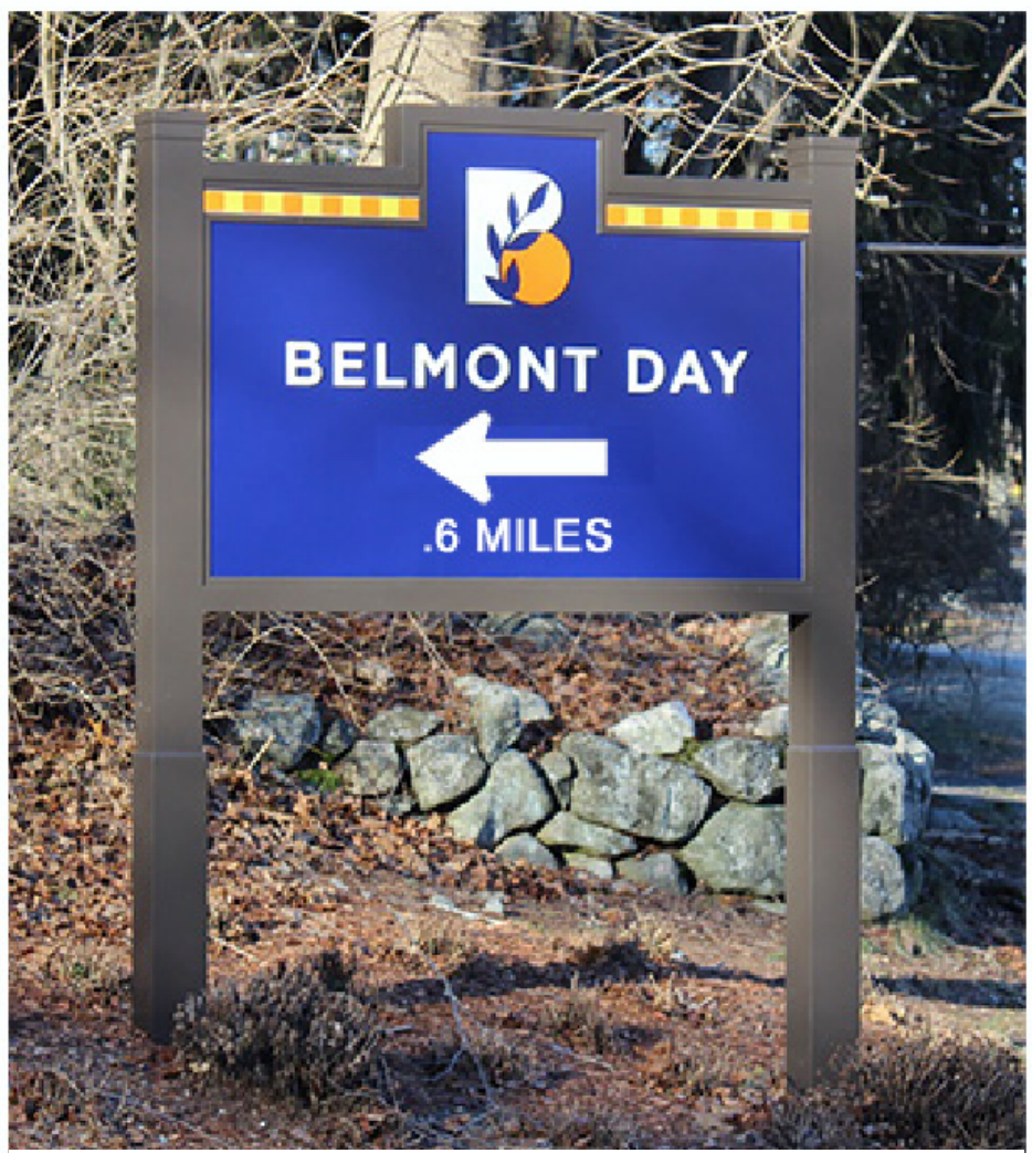
Proposed Sign 2' x 3'

PROPOSED LOCATION FOR NEW CAMPUS DIRECTIONAL SIGNAGE AT CONCORD AVENUE/ MILL STREET INTERSECTION