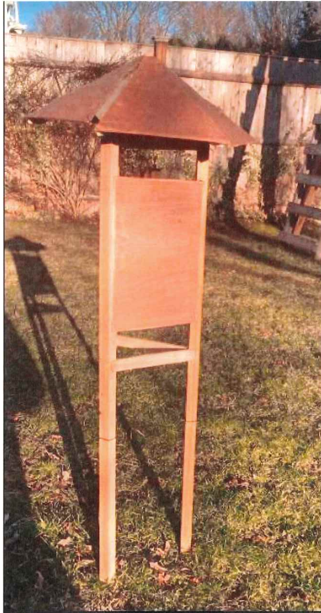
Fig. 3: \frac{1}{4} -scale model of proposed informational kiosk, based on CAD model in Fig. 2 (black line on support posts shows location of ground level; actual kiosk posts will extend four feet below ground level)