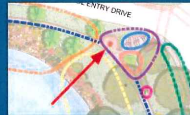
Fig. 1: Location of proposed kiosk (red hexagonal shape) in Belmont Conservation Commission's development plan for Clay Pit Pond