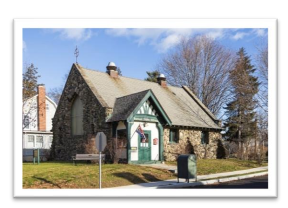
The Benton Library 75 Oakley Road Belmont, MA 02478

The Chenery will be the primary office location for staff. Please stay tuned for more updates on our <u>library website</u>, and in our November newsletter.