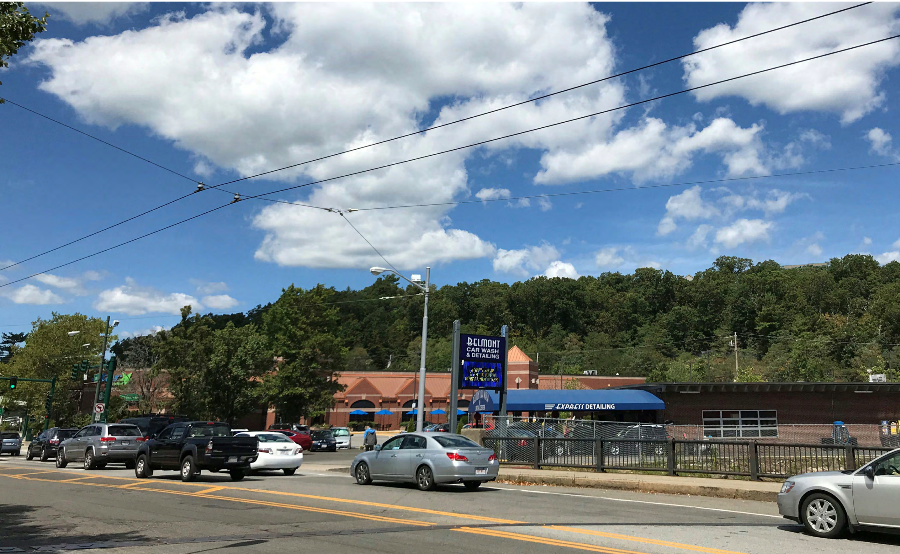
VIEW FROM TRAPELO ROAD ABOVE WAVERLY STATION - SUMMER SEASON