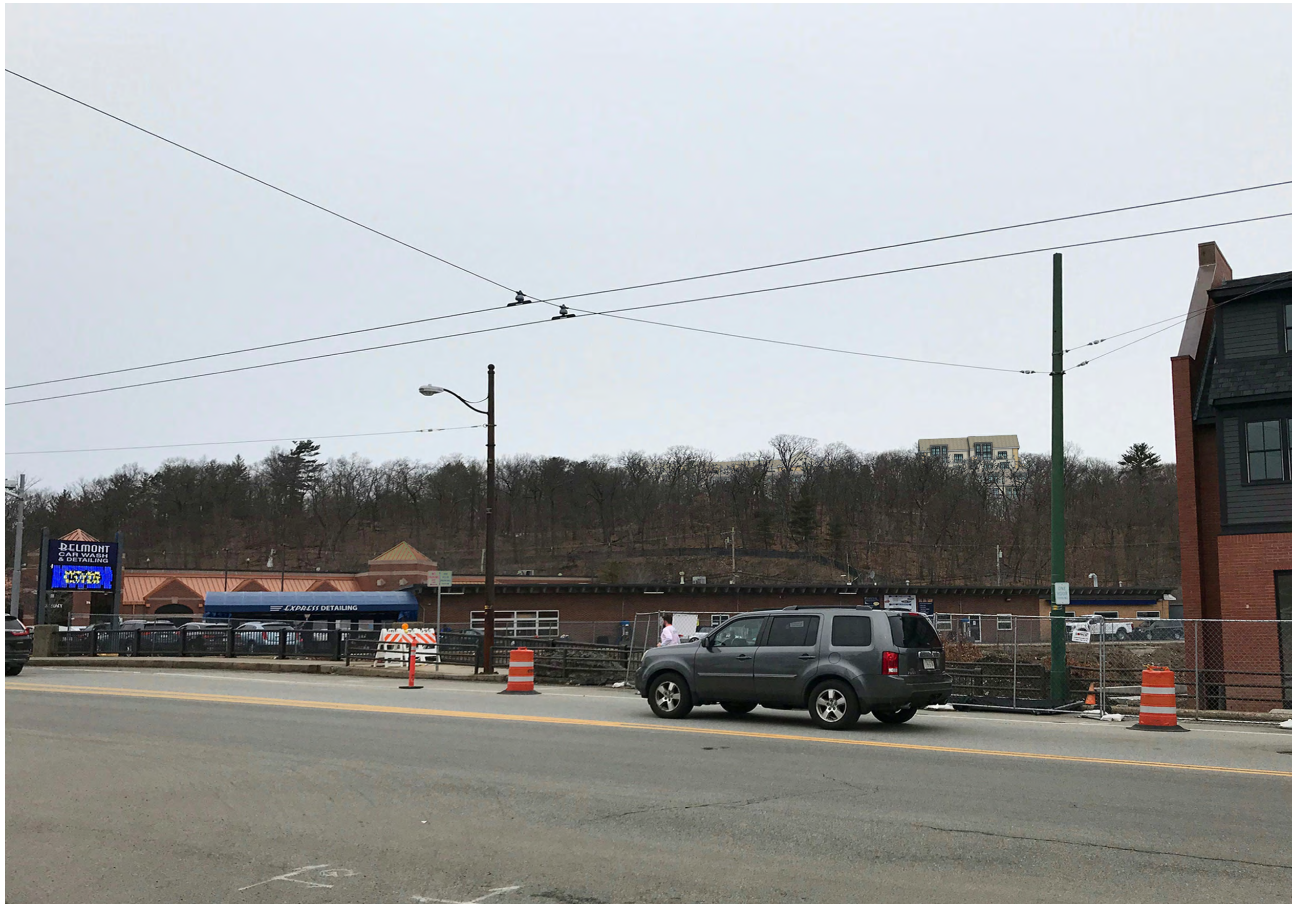
VIEW FROM TRAPELO ROAD & CHURCH STREET - WINTER SEASON