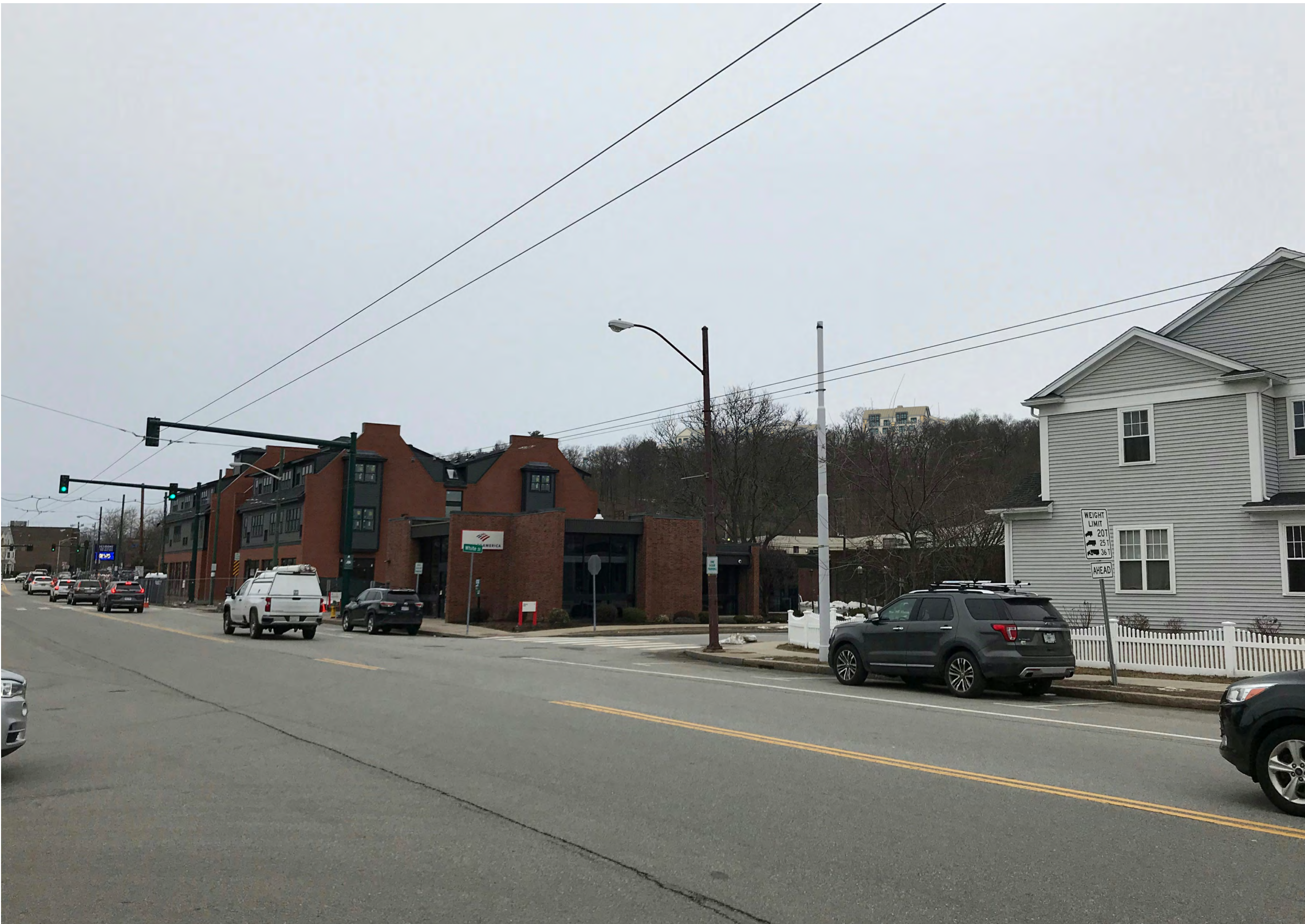
VIEW FROM TRAPELO ROAD & WINTER STREET - WINTER SEASON