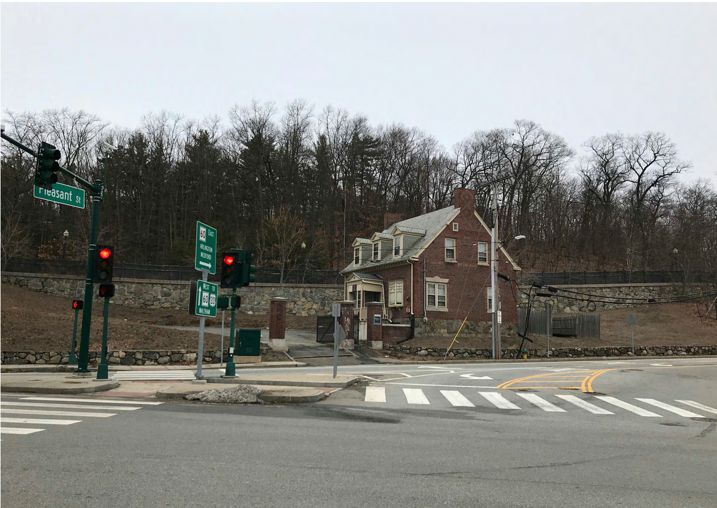
VIEW FROM TRAPELO ROAD & PLEASANT STREET - WINTER SEASON