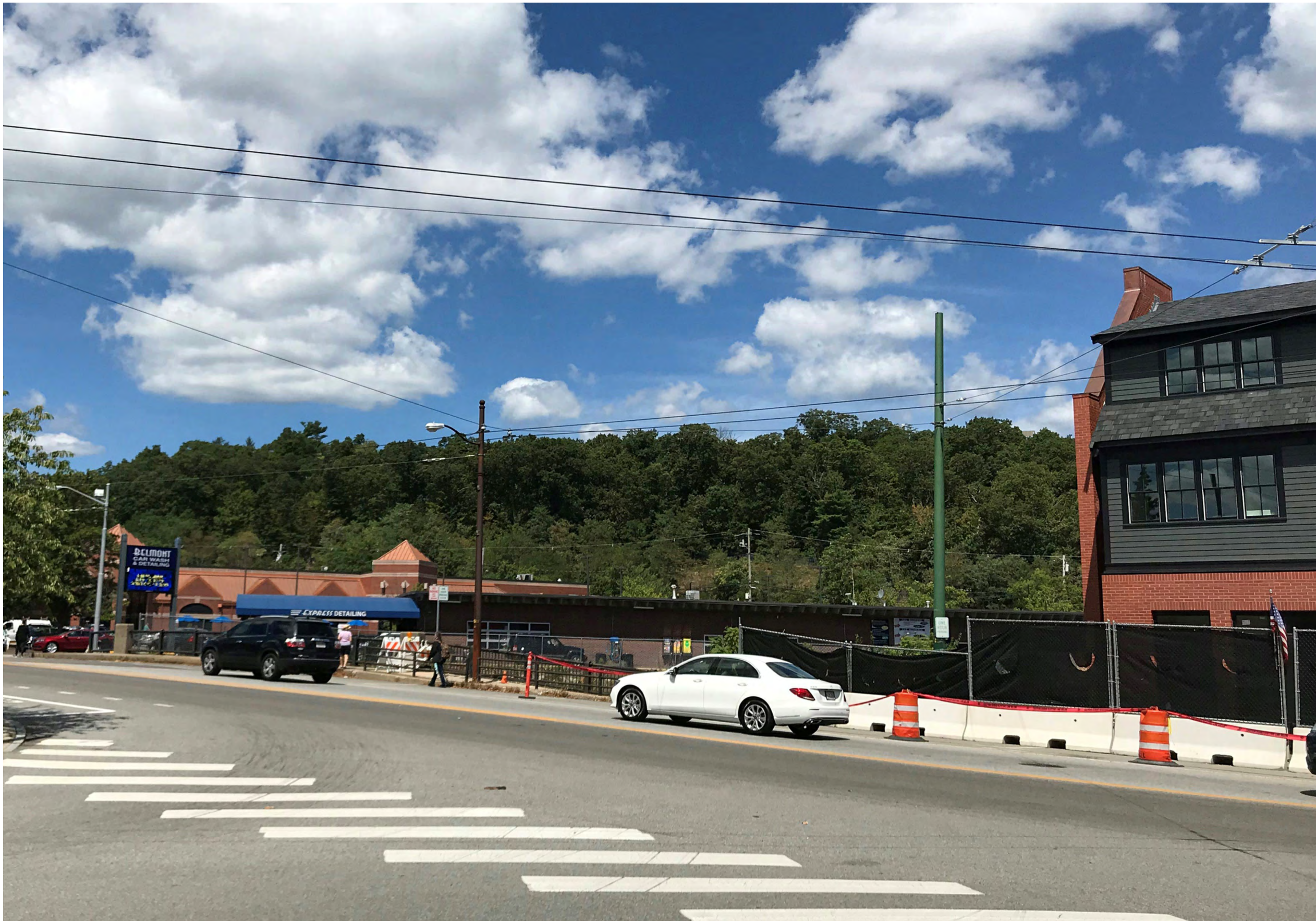
VIEW FROM TRAPELO ROAD & CHURCH STREET - SUMMER SEASON