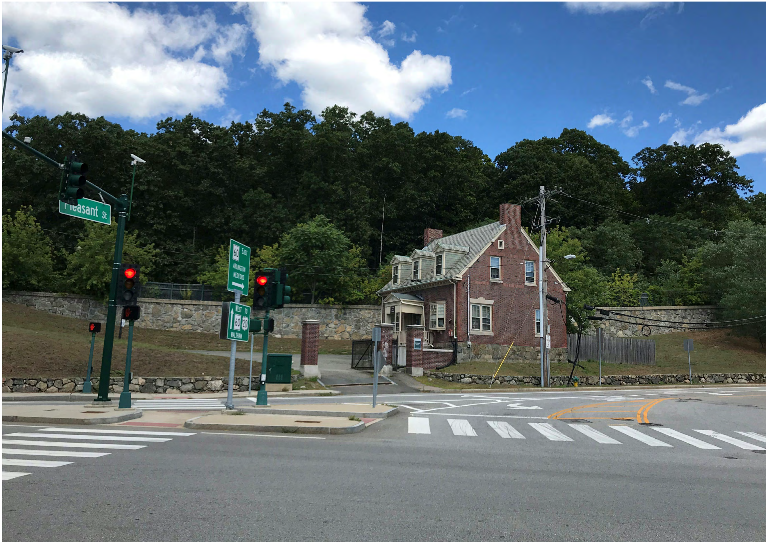
VIEW FROM TRAPELO ROAD & PLEASANT STRET - SUMMER SEASON