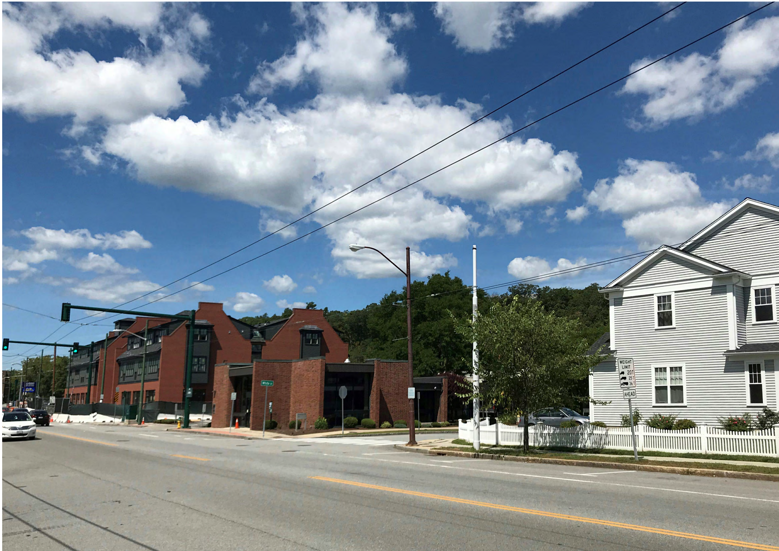
VIEW FROM TRAPELO ROAD & WHITE STRET - SUMMER SEASON