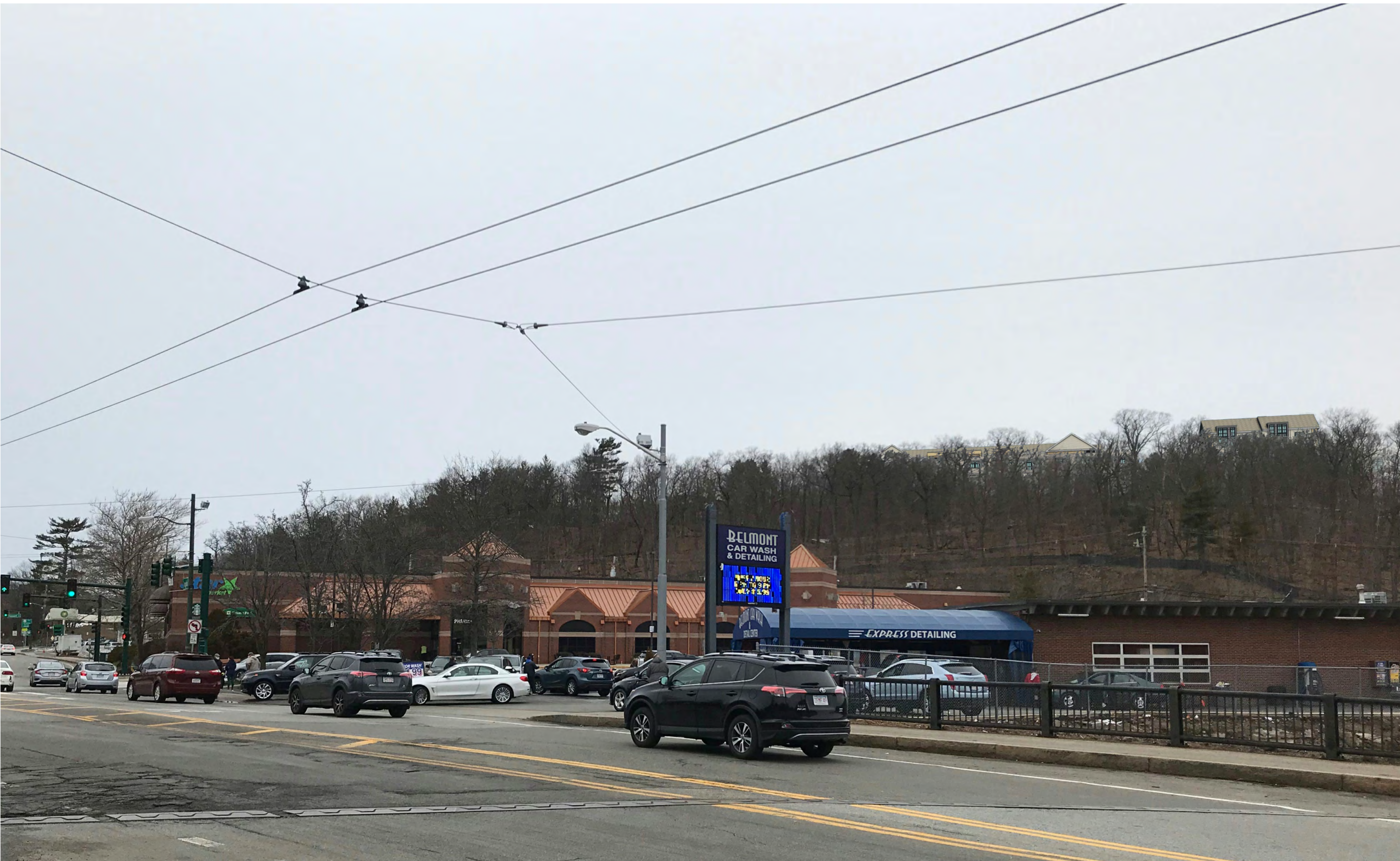
VIEW FROM TRAPELO ROAD ABOVE WAVERLY STATION - WINTER SEASON