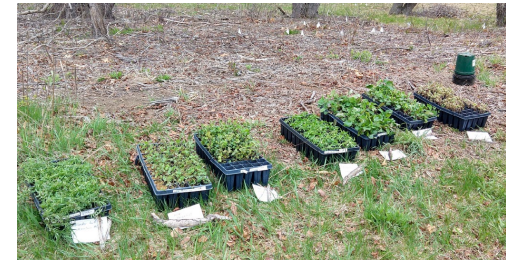
350 native plants ready for planting