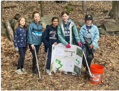
Girl Scouts Troop 82027 volunteers