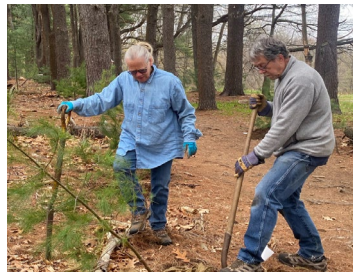
Volunteers planting a white pine