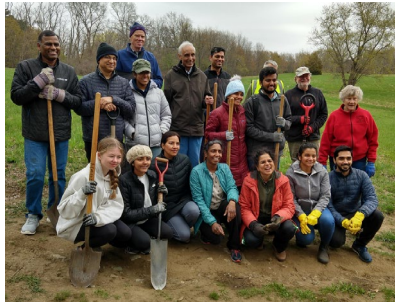
Sai Group and members of the community