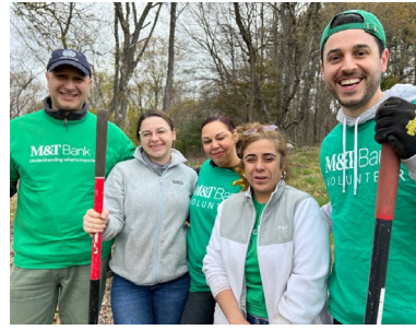
M&T Bank Volunteers