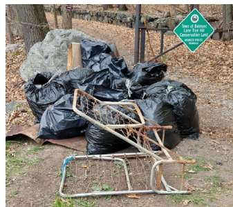
Trash and garlic mustard from Mill Street site