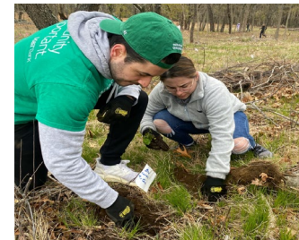
Volunteers planting Native plants