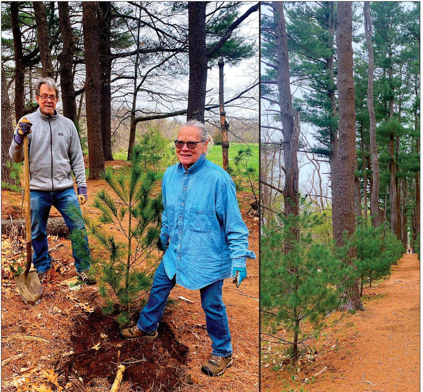
New plantings at the Pine Allee.

Belmont Helps, Clean Green Belmont, Girl Scouts Troop 82027, Land Management Committee for Lone Tree Hill, Mass Audubon Habitat Sanctuary, and Sustainable Belmont