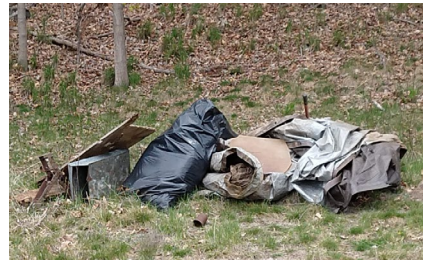
Trash from improvised shelter