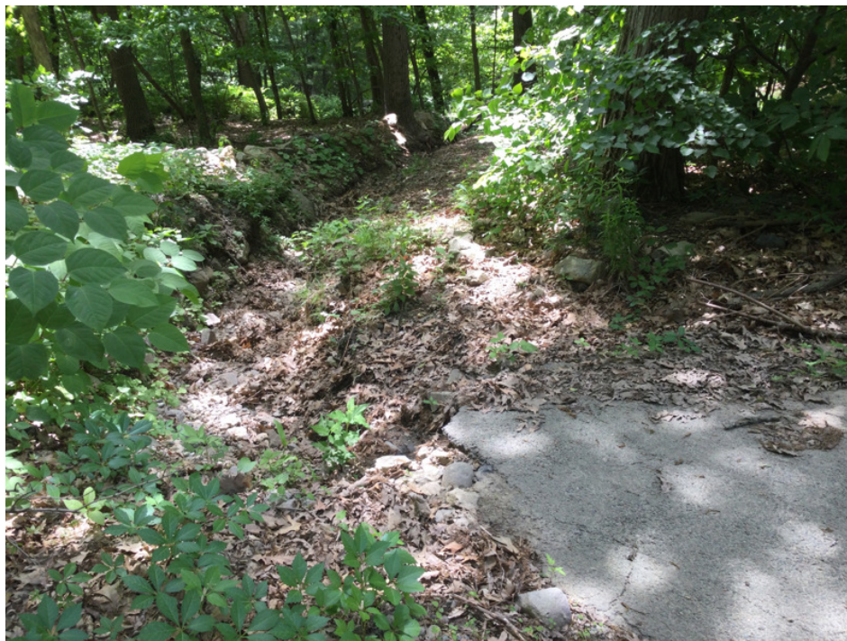
Photopoint 06: 42.39212, -71.18648

New ditch created to keep water off coal road and prevent erosion (upper end). Facing SSW.