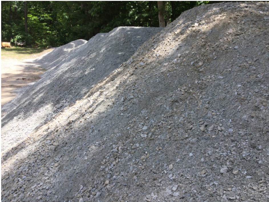
Photopoint 09: 42.39284, -71.18641

New ditch to divert water off the coal road and prevent erosion (lower end). Facing N.