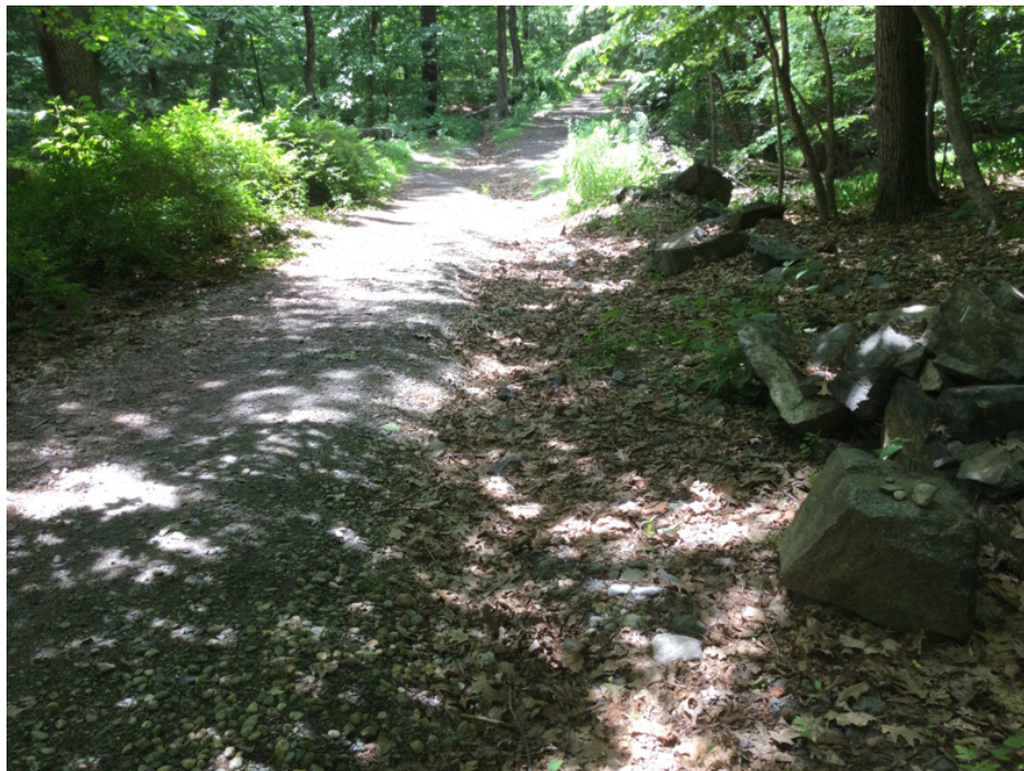
Photopoint 07: 42.39194, -71.18632

New ditch created to keep water off coal road and prevent erosion (upper end). Facing SSW.