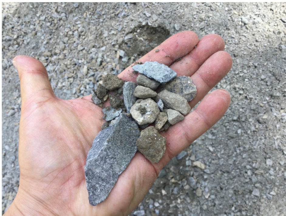
Photopoint 09: 42.39284, -71.18641

Stone material being used to prevent future erosion on the Coal Road (close-up). Facing NNE.