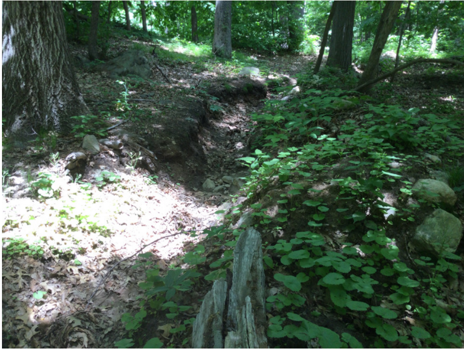
Photopoint 08: 42.39191, -71.18639

New ditch to divert water off the coal road and prevent erosion (lower end). Facing N.