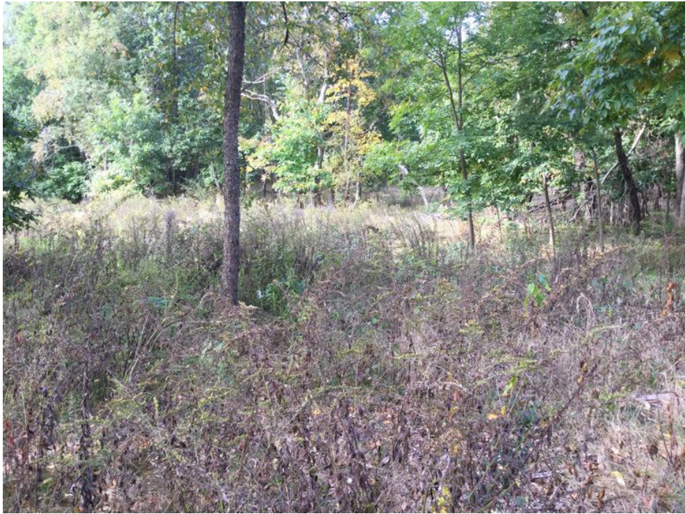
Photopoint 08 --New native plantings in this area

(42.40003, -71.19214--Facing:W--File:233 (237.02)--McLean Cemetery Lone Tree Hill 2023-10-11 24.jpg )