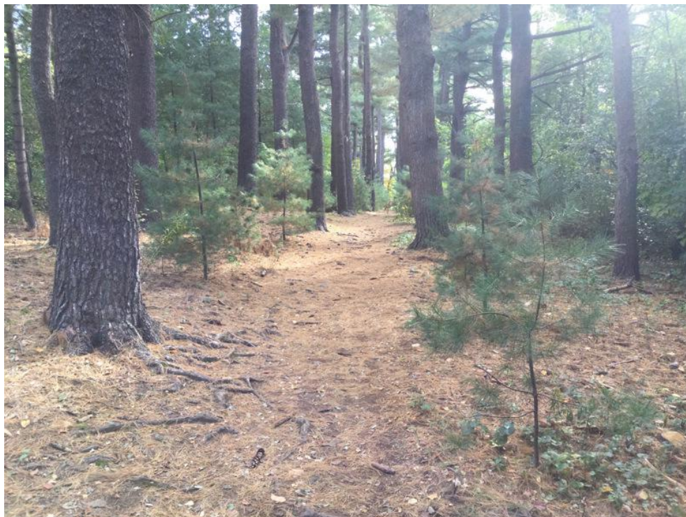
Photopoint 06 --Replacement pines planted between older pines

(42.39994, -71.19036--Facing:SE--File:233 (237.02)--McLean Cemetery Lone Tree Hill 2023-10-11 18.jpg )