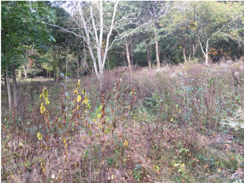
Photopoint 08--New native plantings in this area

(42.40003, -71.19214--Taken by:Tom Dodd--Facing:NW--File:233 (237.02)--McLean Cemetery Lone Tree Hill 2023-10-11 22.jpg )