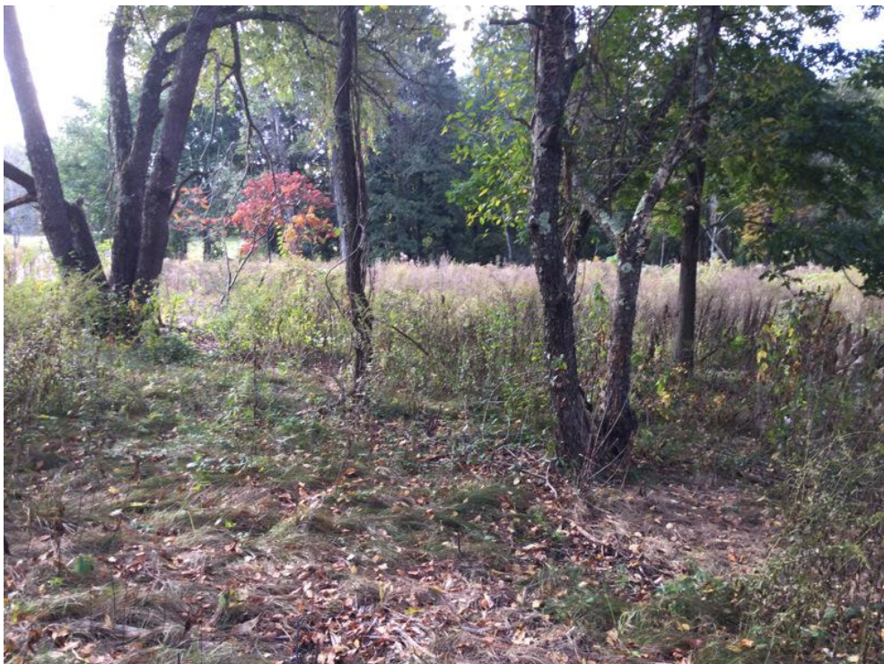
Photopoint 08 --New native plantings in this area

(42.40003, -71.19214--Facing:W--File:233 (237.02)--McLean Cemetery Lone Tree Hill 2023-10-11 24.jpg )