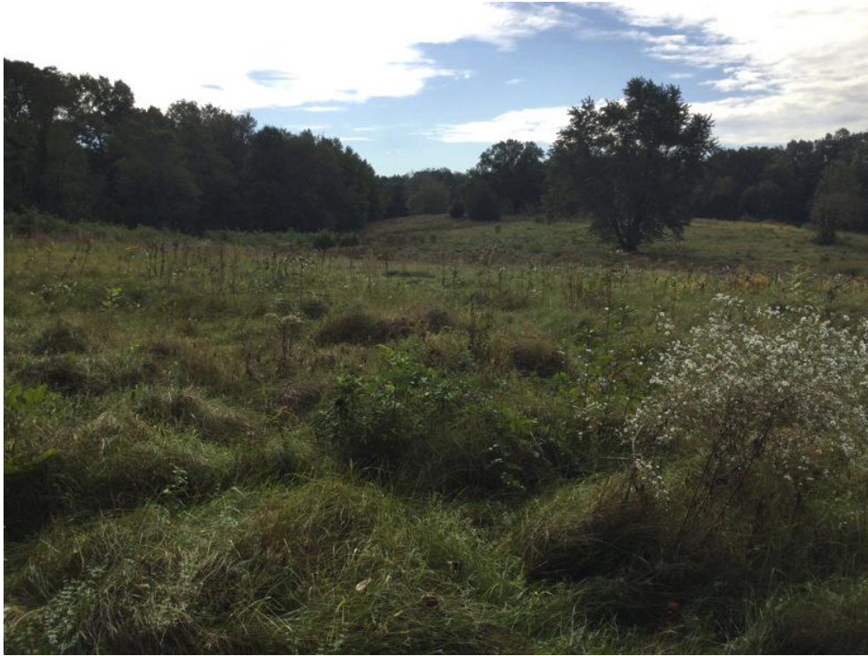
Photopoint 07 --View of Great Meadow

(42.4002, -71.19183--Taken by:Tom Dodd--Facing:SSW--File:233 (237.02)--McLean Cemetery Lone Tree Hill 2023-10-11 20.jpg )