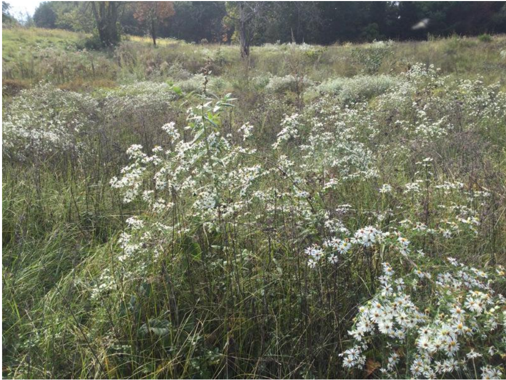
Photopoint 09 --Small white aster? growing in Great Meadow

(42.39934, -71.19193--Taken by:Tom Dodd--Facing:SSW--File:233 (237.02)--McLean Cemetery Lone Tree Hill 2023-10-11 26.jpg )