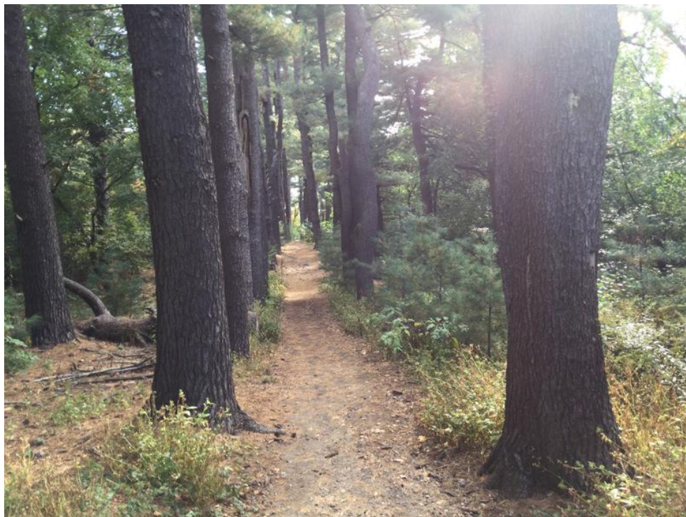
Photopoint 05 --View along pine allee - some young replacement pines planted.

(42.40002, -71.19062--Taken by:Tom Dodd--Facing:SSE--File:233 (237.02)--McLean Cemetery Lone Tree Hill 2023-10-11 16.jpg )