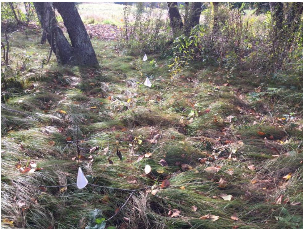
Photopoint 08 --New native plantings. White wood aster

(42.4002, -71.19183--Taken by:Tom Dodd--Facing:SSW--File:233 (237.02)--McLean Cemetery Lone Tree Hill 2023-10-11 20.jpg )