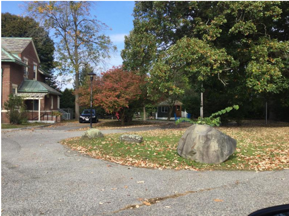
Photopoint 10 --View of new Yurt in center background. Remote Imagery shows that this is partially on the CR - but the CR map boundaries may be inaccurate and needs further review.

(42.39934, -71.19193--Facing:SSW--File:233 (237.02)--McLean Cemetery Lone Tree Hill 2023-10-11 26.jpg )