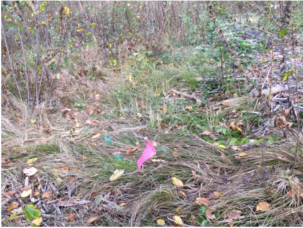
Photopoint 08--New native plantings - Butterfly weed

(42.40003, -71.19214--Facing:NW--File:233 (237.02)--McLean Cemetery Lone Tree Hill 2023-10-11 22.jpg )