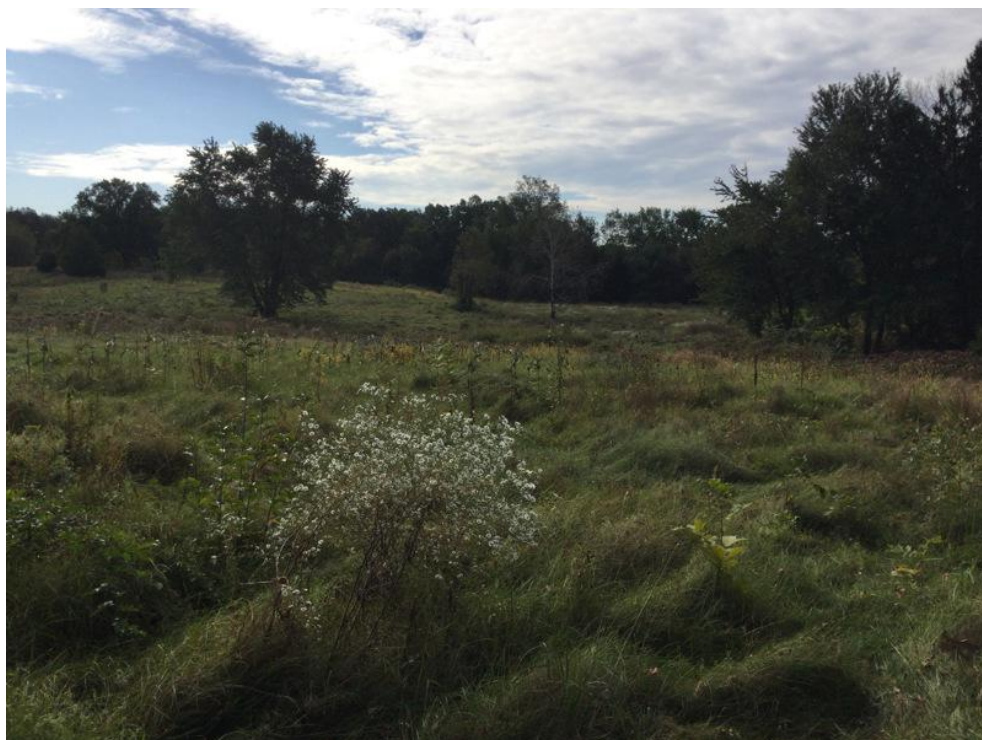
Photopoint 07 --View of Great Meadow

(42.39994, -71.19036--Taken by:Tom Dodd--Facing:SE--File:233 (237.02)--McLean Cemetery Lone Tree Hill 2023-10-11 18.jpg )