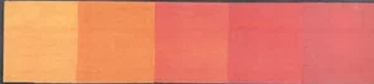
WHITE PINE UNTREATED

A stain's opacity is the degree to which it reveals the natural grain of the wood.