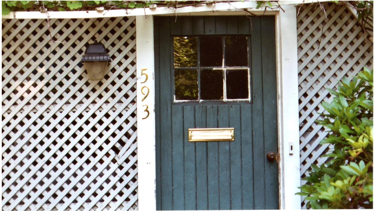
Lower Door circa 1994 with plastic fixture