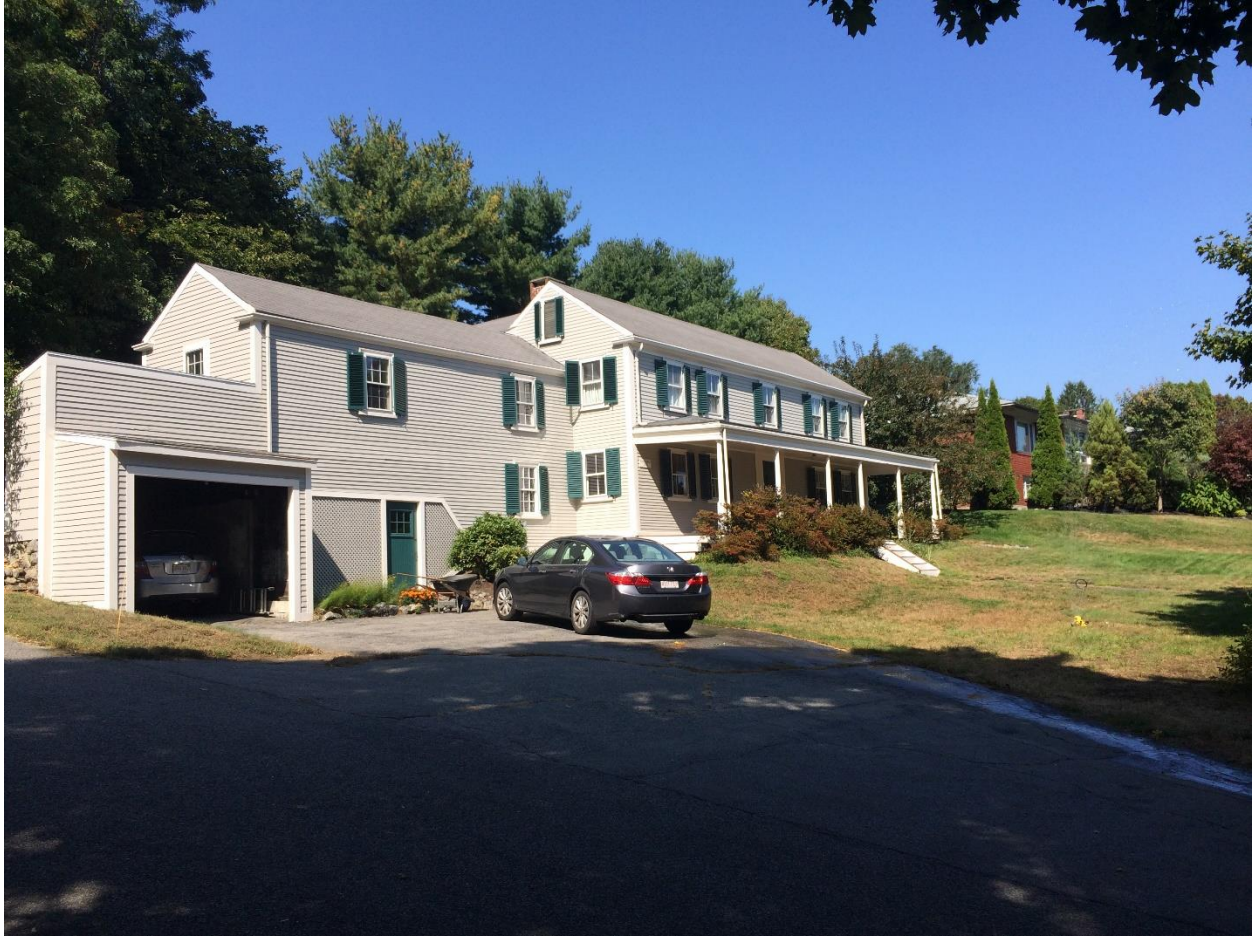
593 Pleasant Street & 585 Pleasant Street