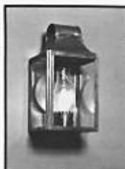
Period Lighting Fixtures are U.L. Listed L302 Lantern with optional pewter reflector*

* Available on lanterns L301, L302, L303, and L303A. See price list.