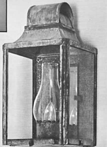
L302 — LANTERN Exterior Wall Mounted Dimensions — 8 1/2" W x 17 1/2" H — UPS 15 Lbs.