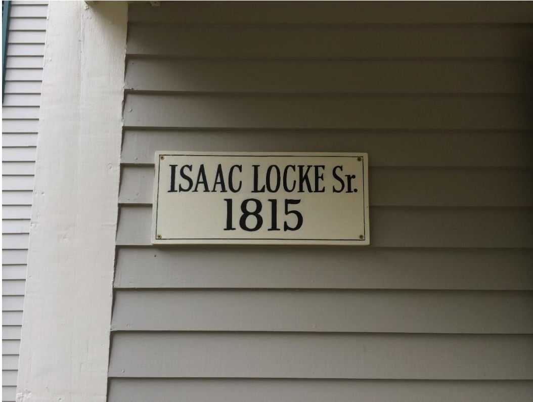
Historic District Plaque