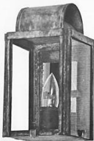
L301 — LANTERN Exterior Wall Mounted Dimensions — 6" W x 11" H — UPS 10 Lbs.