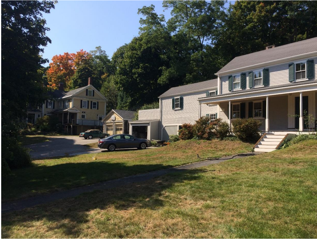
605 Pleasant Street & 593 Pleasant Street

And here are two photographs showing our house in relation to the houses on either side: