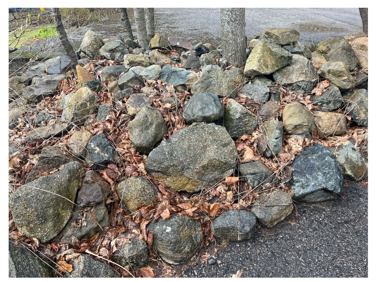
The antique stones kept from our yard

The use of these original stones will give the wall that old look, as if it had always been there as you can see from the photo montage on the next page