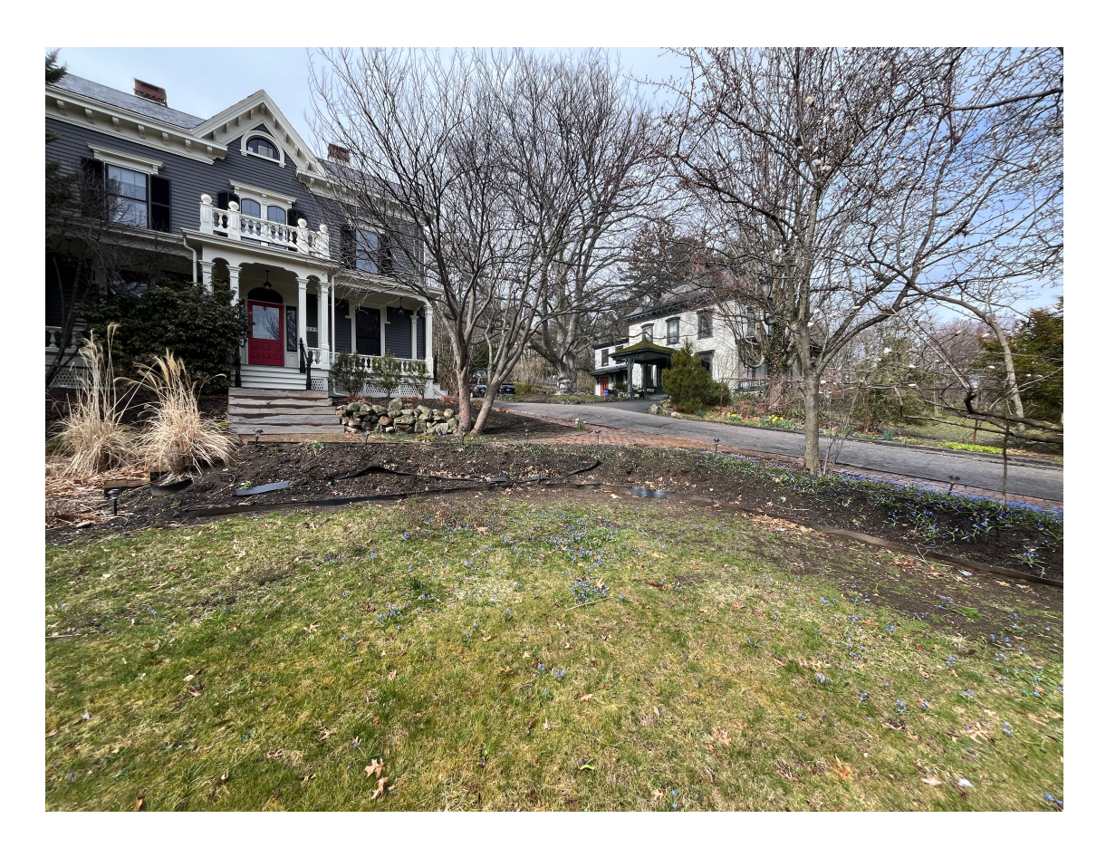
The front yard as it is now