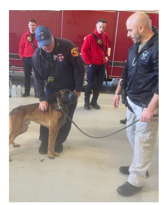
EMTs and Paramedics Participate in Nero's Law Training

The Fire Department provides first response Basic Life Support (BLS) and Advanced Life Support (ALS) transporting service for the community. This equates to faster access to basic care from EMTs as well as advanced care from Paramedics including advanced airway control, intravenous (IV) access, medication administration, cardiac monitoring, interpretation, and treatment/defibrillation. These highly trained Paramedics work together with our Emergency Medical Technicians (EMTs) to transport patients to area hospitals.