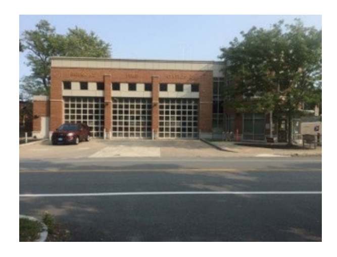
Town of Belmont ADA Transition Plan