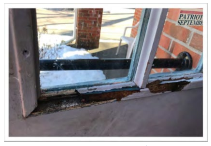
Rust and failing joint sealant