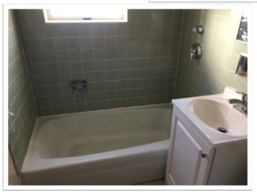
Water damage in bathrooms