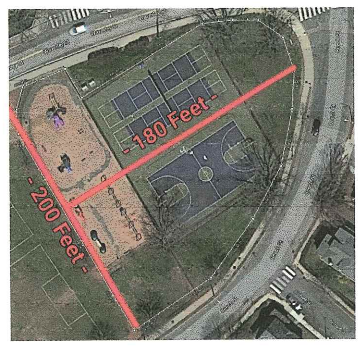
Figure 1: Town Field Playground located at the intersection of Beech and Waverly Streets.

The space is roughly 180 feet by 200 feet, and an approximate area of 36,000 ft<sup>2</sup> as shown in the figure below.