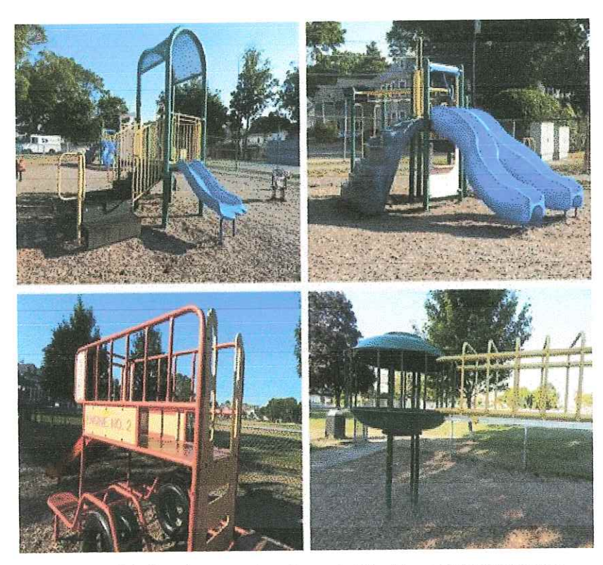
Figure 2: Existing playground equipment at the Town Field Playground.

The focus of this application is to request the final sum of money required to demo the existing playground and courts and construct the new playground and courts per the architectural drawings. Note, the adjacent soccer and baseball fields are outside the scope of work, and all plans are expected to be executed without affecting these fields.