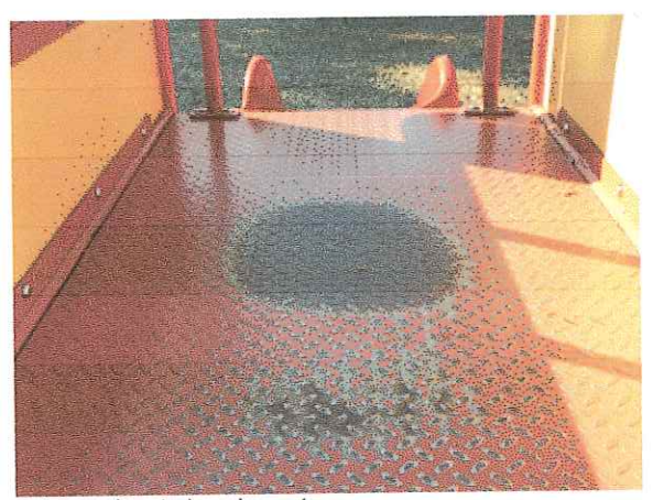
Aging and rusted equipment.