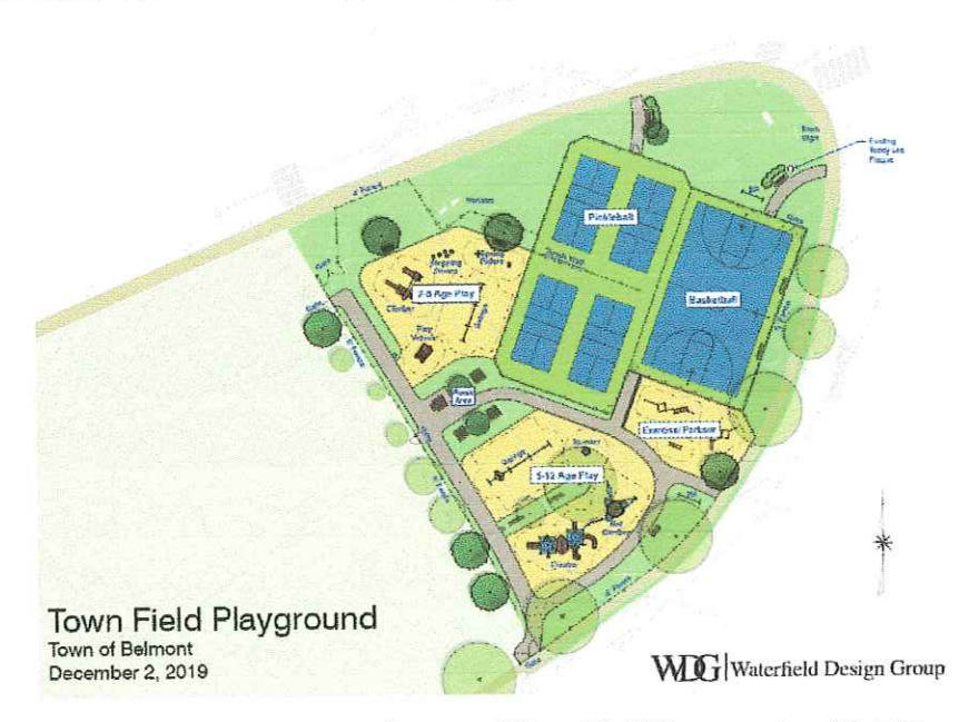
Figure 5: WDG rendering of proposed Town Field Playground and Courts.

Figure 5 shows the final site plan, which was used to determine current cost estimates. These estimates were updated in September 2021 and will be reviewed prior to going out to bid if the project receives a favorable vote during the spring 2022 Town Meeting.