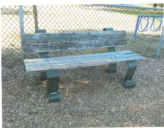
Park benches aging with wood prone to splintering.