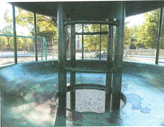
Aging and rusted equipment.