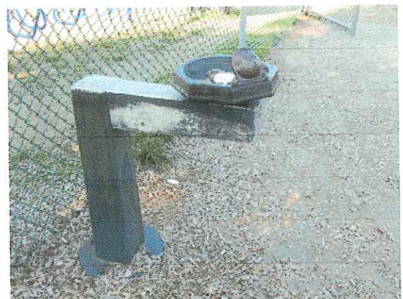
Water fountain rusted and not working. Should be removed.

The images in Figure 4 were taken at the playground, and visually highlight the need to rehabilitate the Town Field Playground.