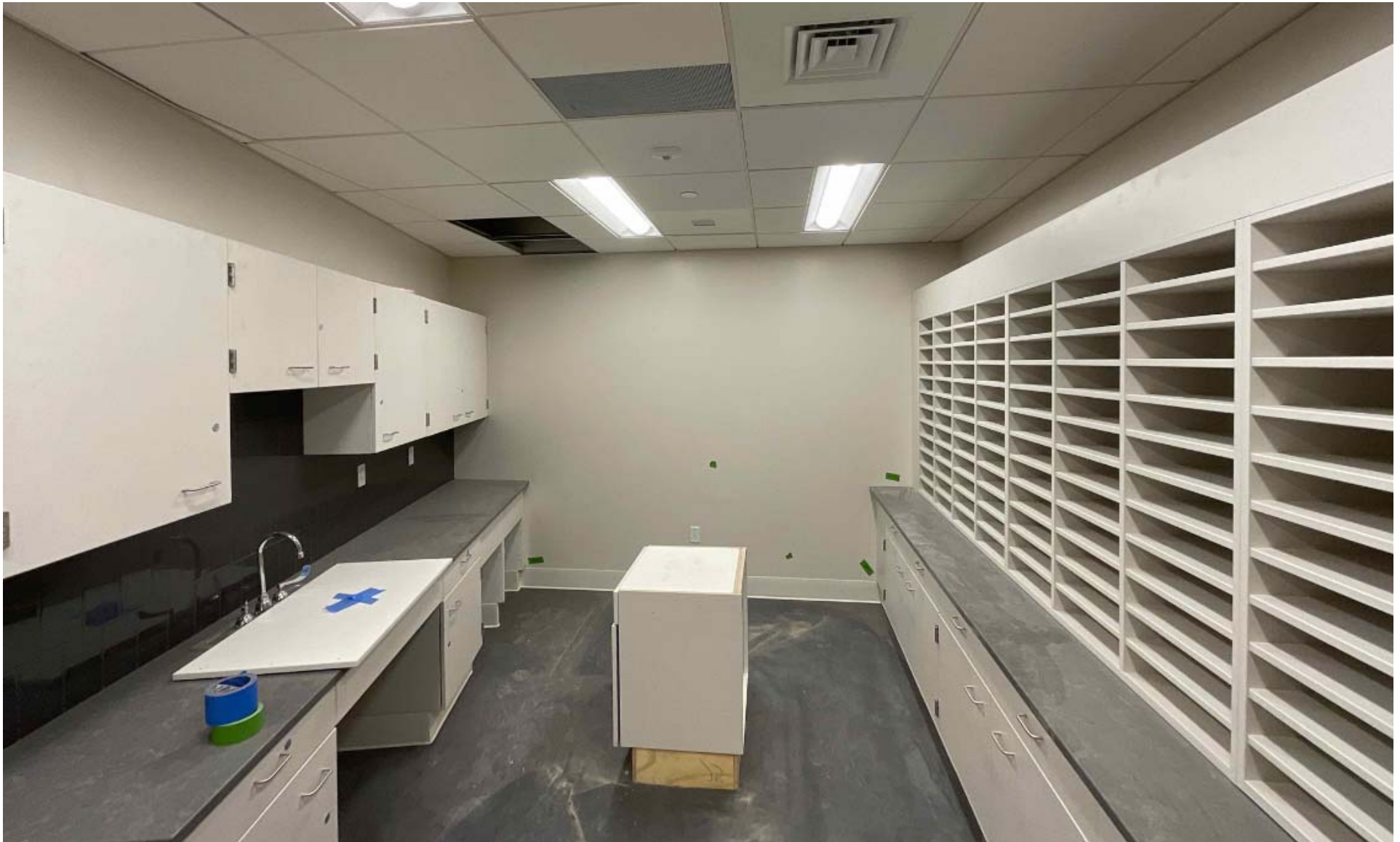
Administration Break Room