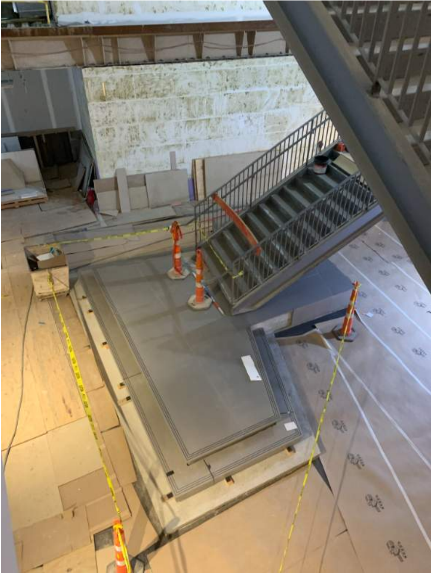
Stair 4 Plinth and Area F Level 1 Corridor