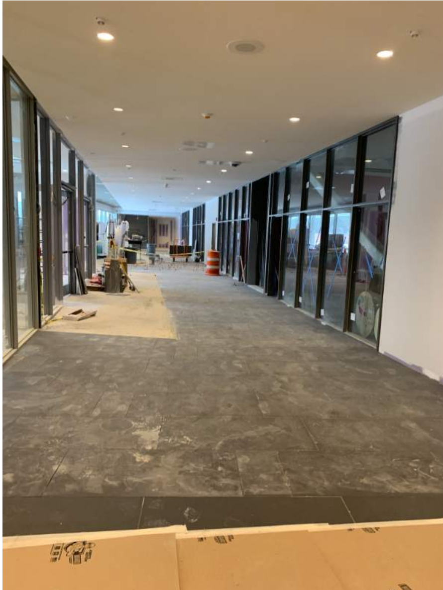
Area D Level 1 Corridor