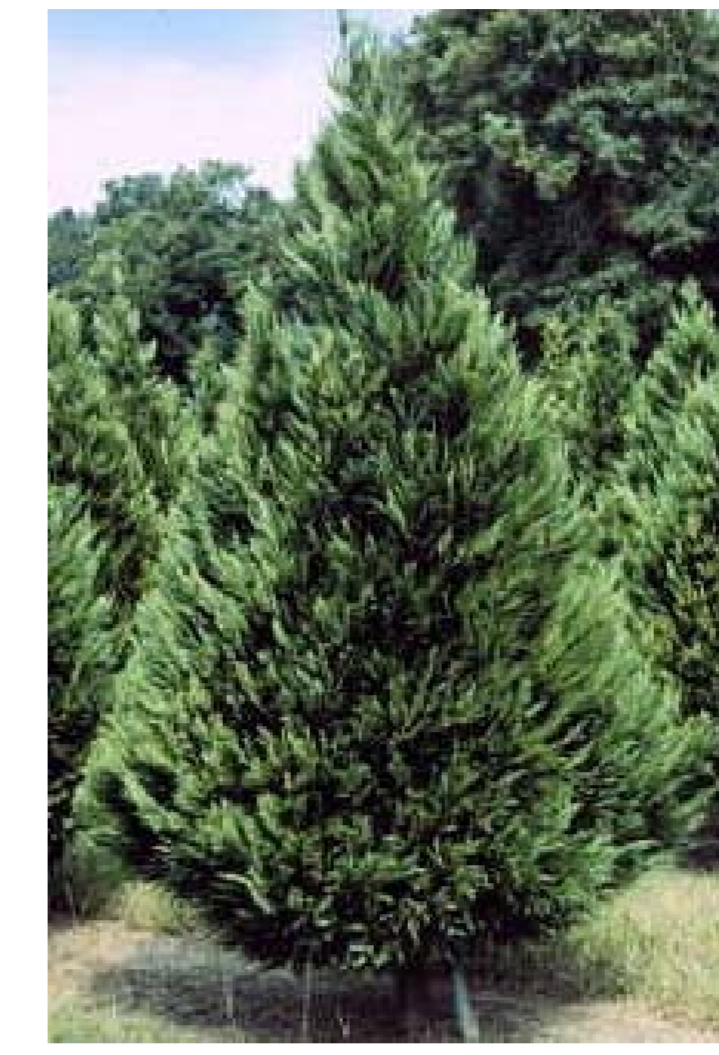
LEYLAND CYPRESS Fast growing, conical tree to 60' tall