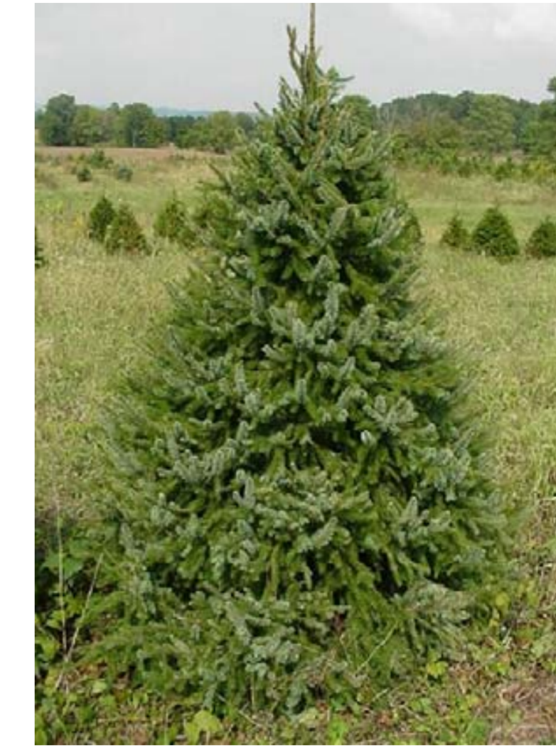
SERBIAN SPRUCE 50' to 60' tall and 20' to 25' wide