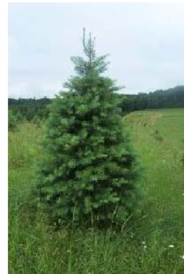
CONCOLOR FIR 30' to 50' tall and 15' to 20' wide